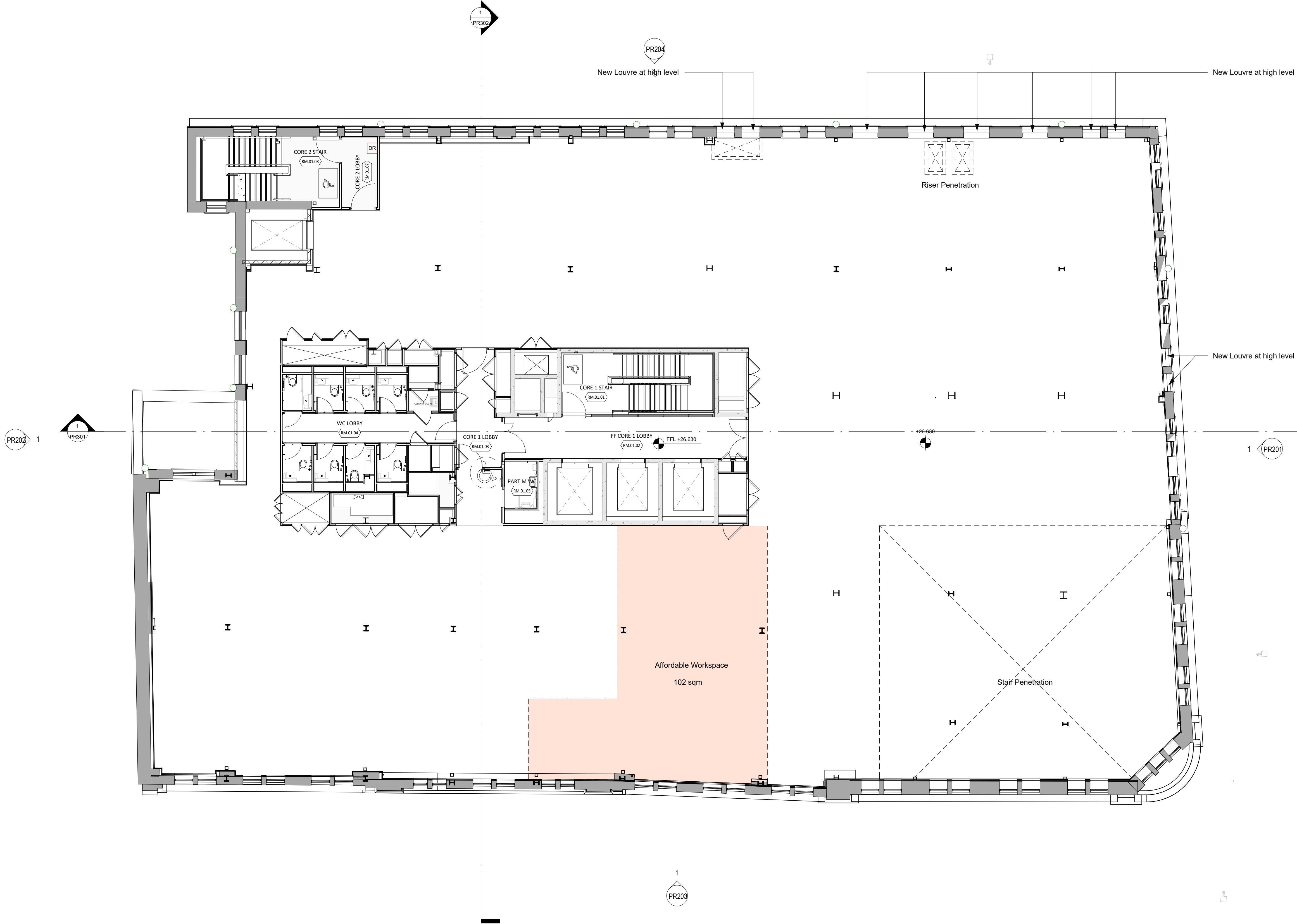
01 First Floor Plan GA107 1 : 100