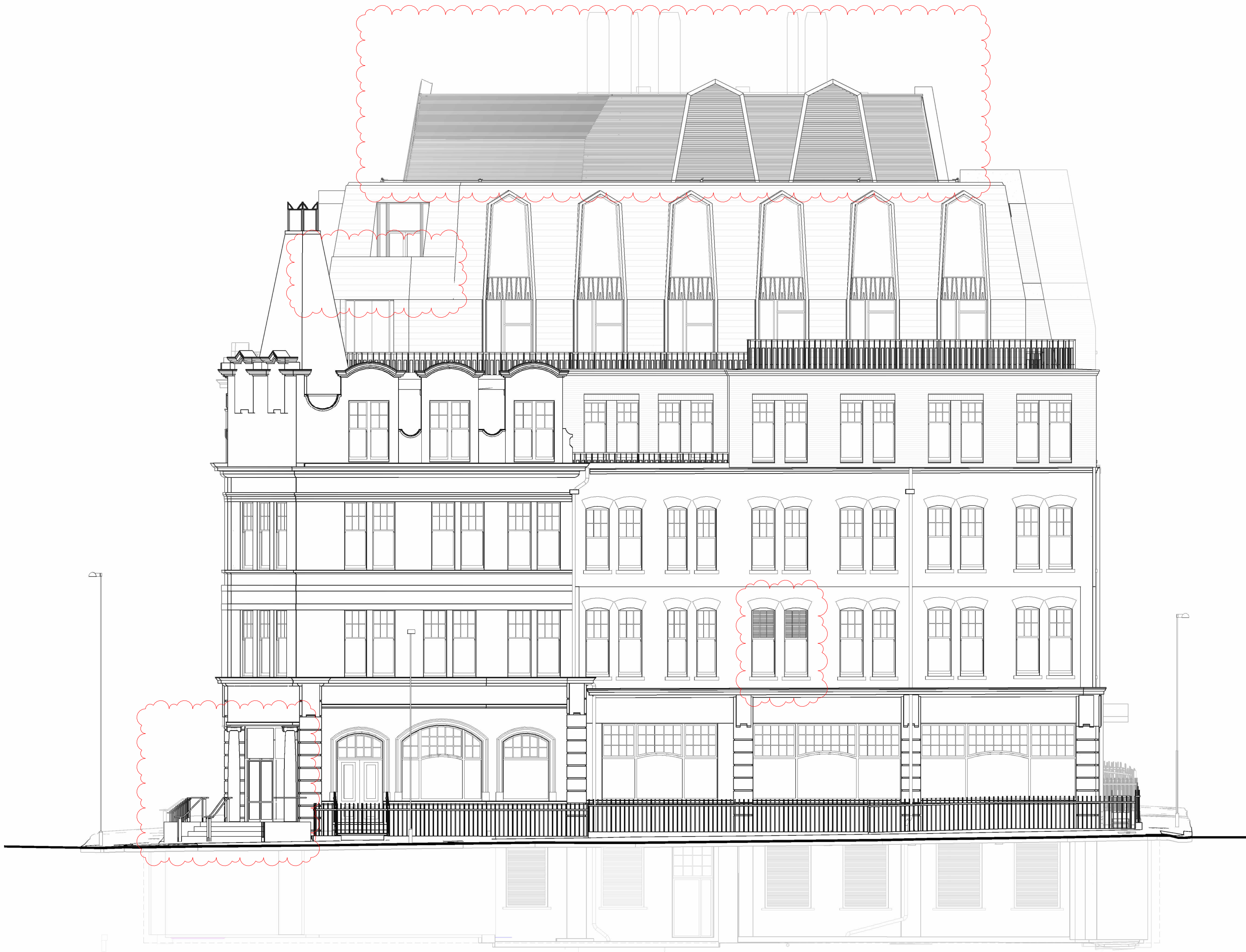
1 North Elevation PR201 1 : 100