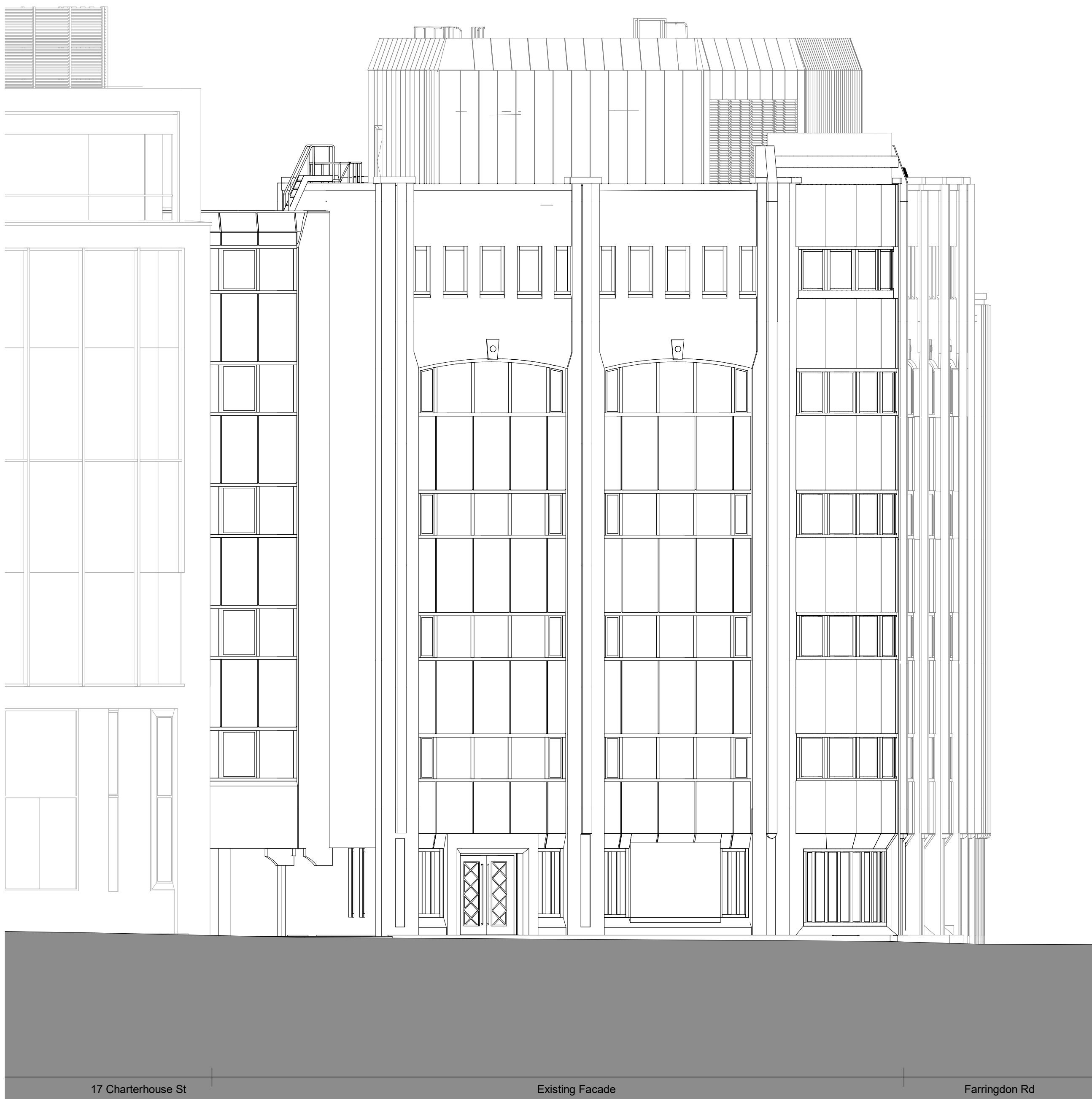
① Existing Elevation South 1 : 100