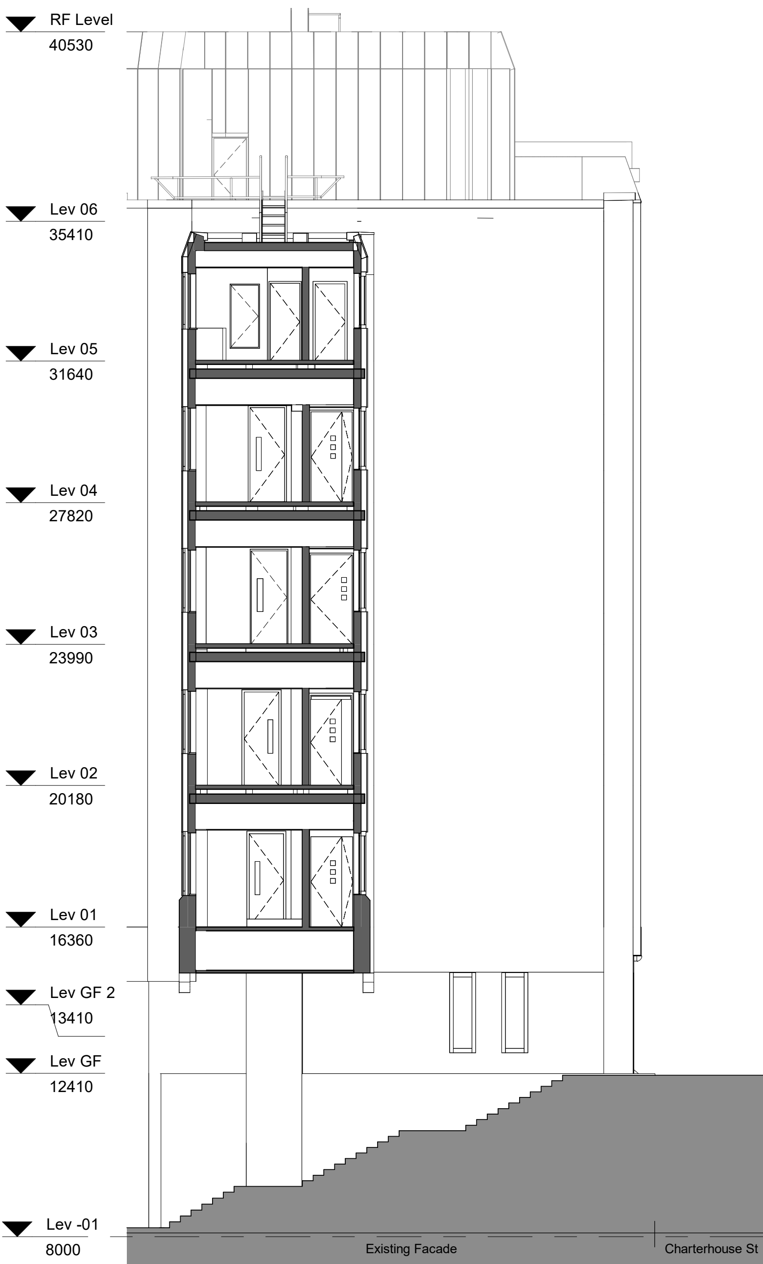
② Existing Elevation West - SH Bridge 1 : 100