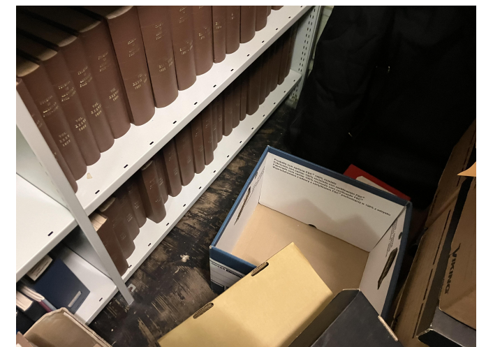
Image 2 - Storage Items at location of proposed trial hole