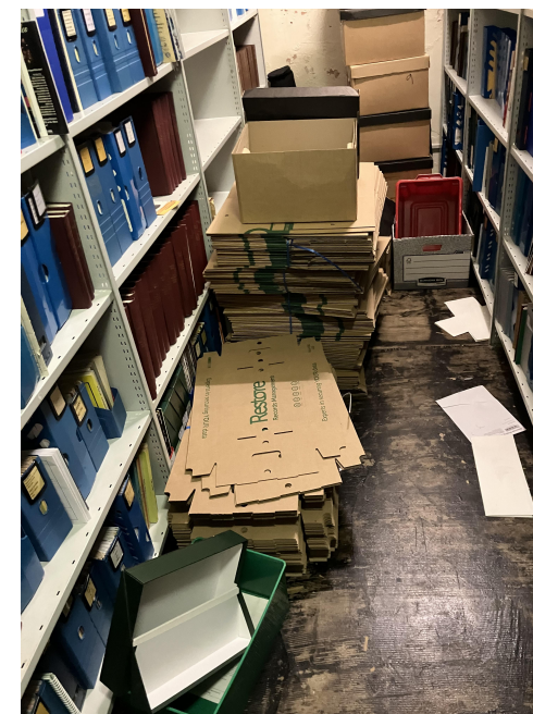
Image 1 - Storage Items