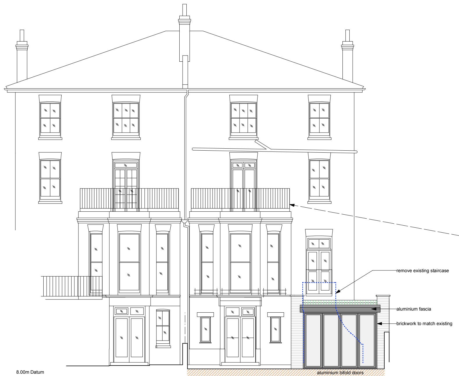
Proposed Rear Elevation (NO CHANGES)