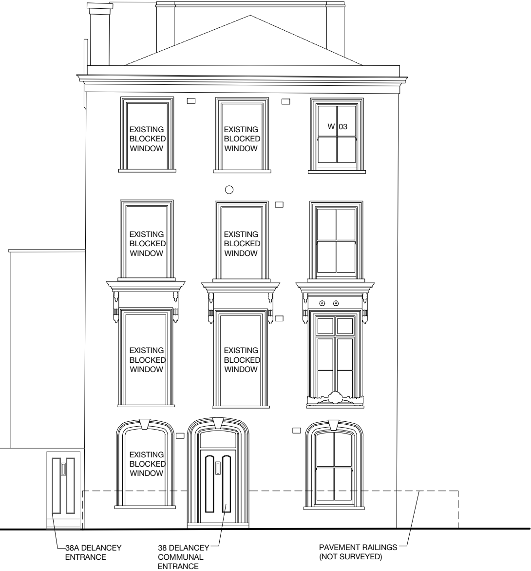
01 EXISTING SOUTH-WEST ELEVATION 00B-02 SCALE 1:100