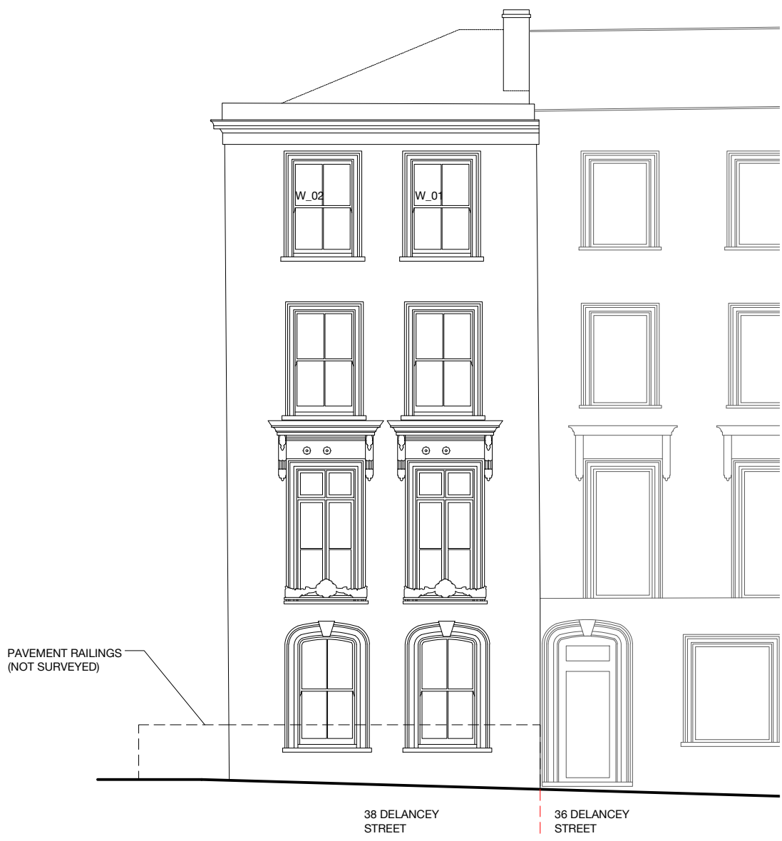
01 PROPOSED SOUTH-EAST ELEVATION 22-01 SCALE 1:100