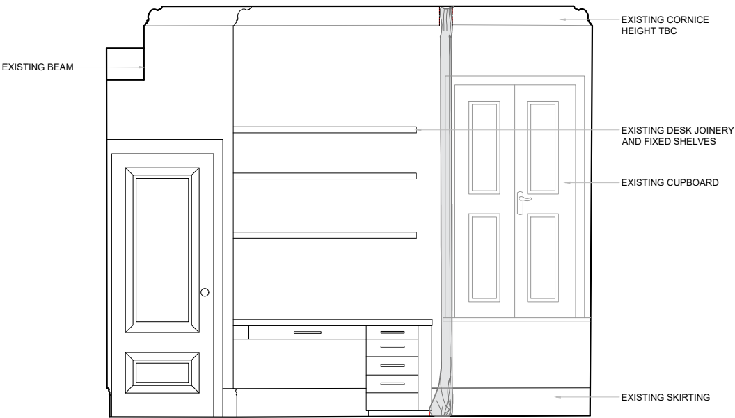
ELEVATION D - EXISTING