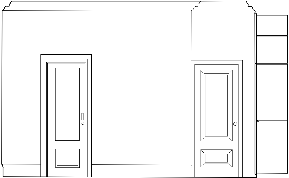
ELEVATION B - EXISTING