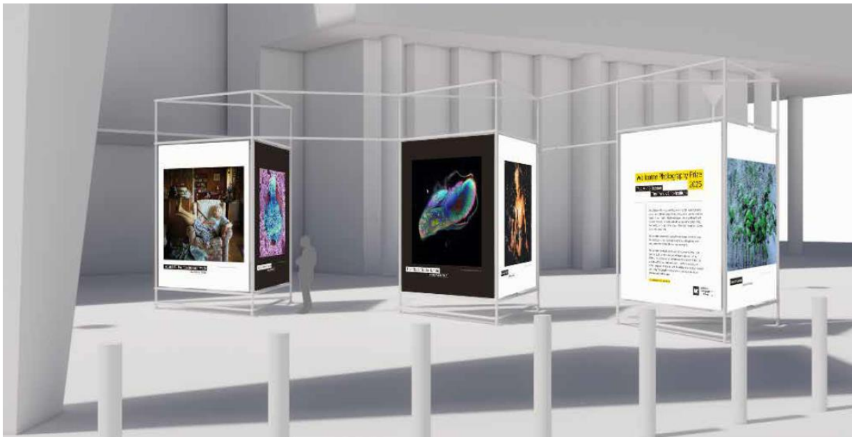
Figure 2: Visual of the freestanding exhibition board (3x structures; 9x artworks)

For further details on the proposed signage (including dimensions and visuals), please refer to the Signage document, titled 'The Francis Crick Institute Forecourt Outdoor Display Installation' (V1, date: 14.04.25).