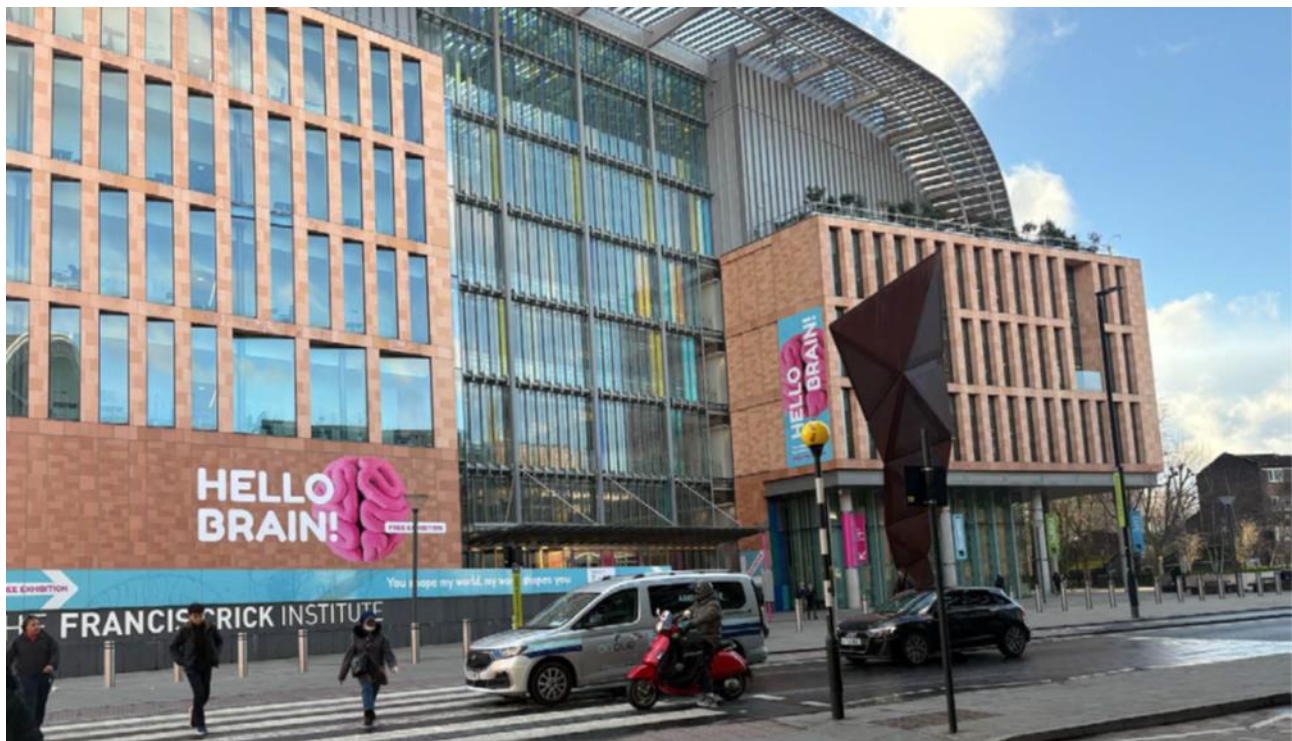
Figure 1: Existing View of the site from Midland Road

As noted above, there is a current application for advertisement consent for the display of vinyl signage on the building (ref: 2025/1393/A) for the same Wellcome Photography Prize 2025 Exhibition.