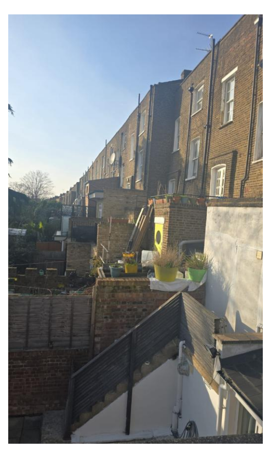
Fig. 02- Rear access of the property