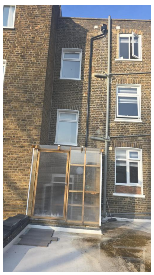
Fig. 03- Rear of the property with new structure.