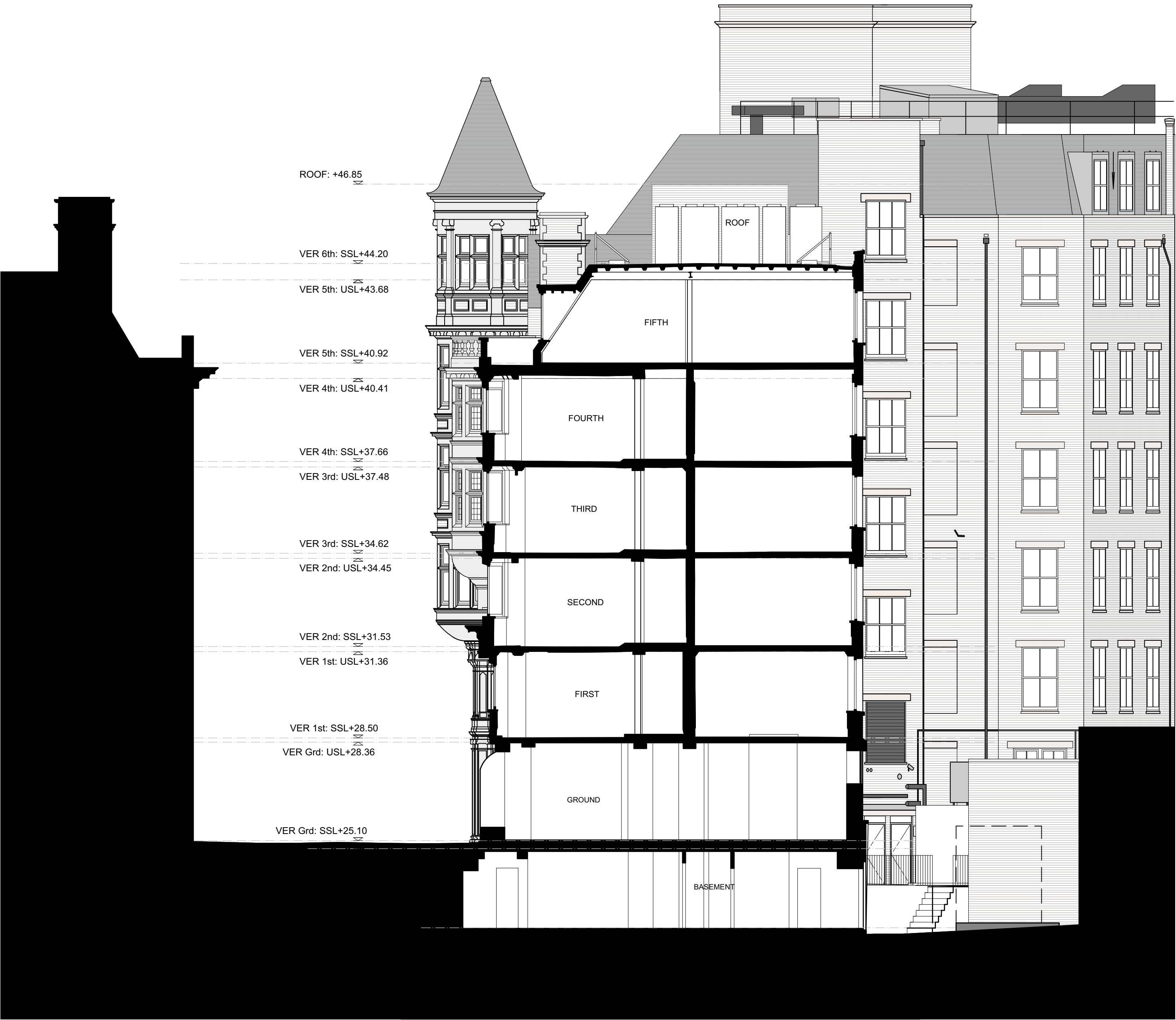
1 Vernon & Sicilian House Existing Section 03 Scale: 1:100