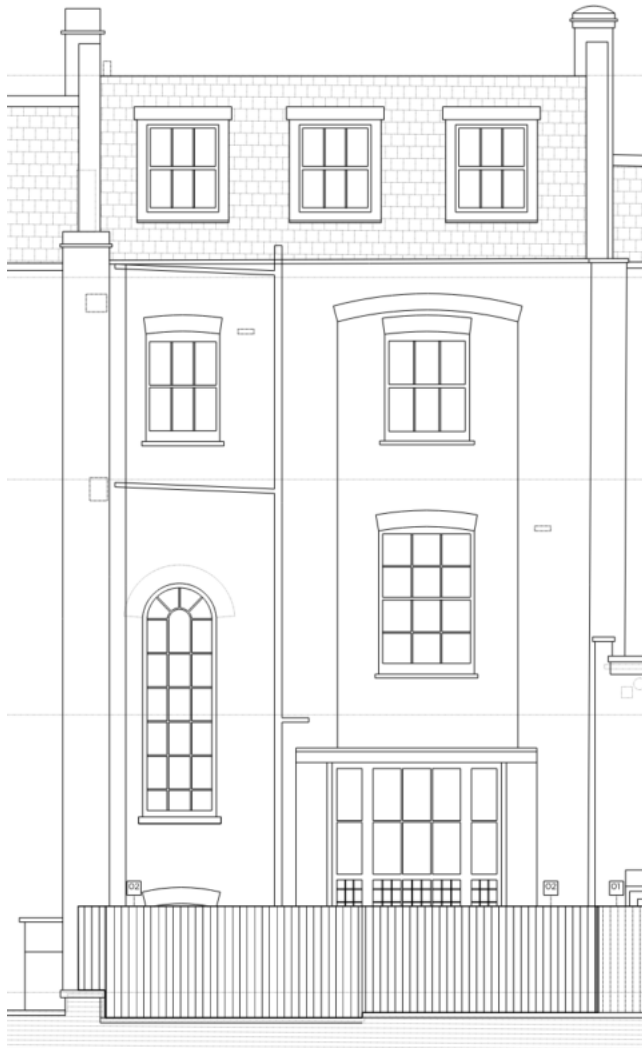
Fig 5. Proposed rear elevation with privacy screens in foreground.