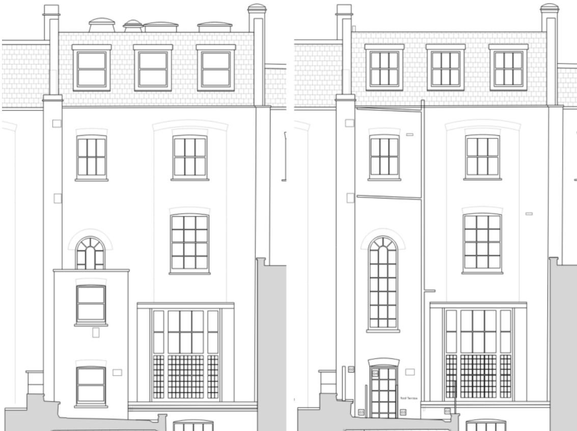
Fig 2. Existing (left) and proposed (right) rear elevation.