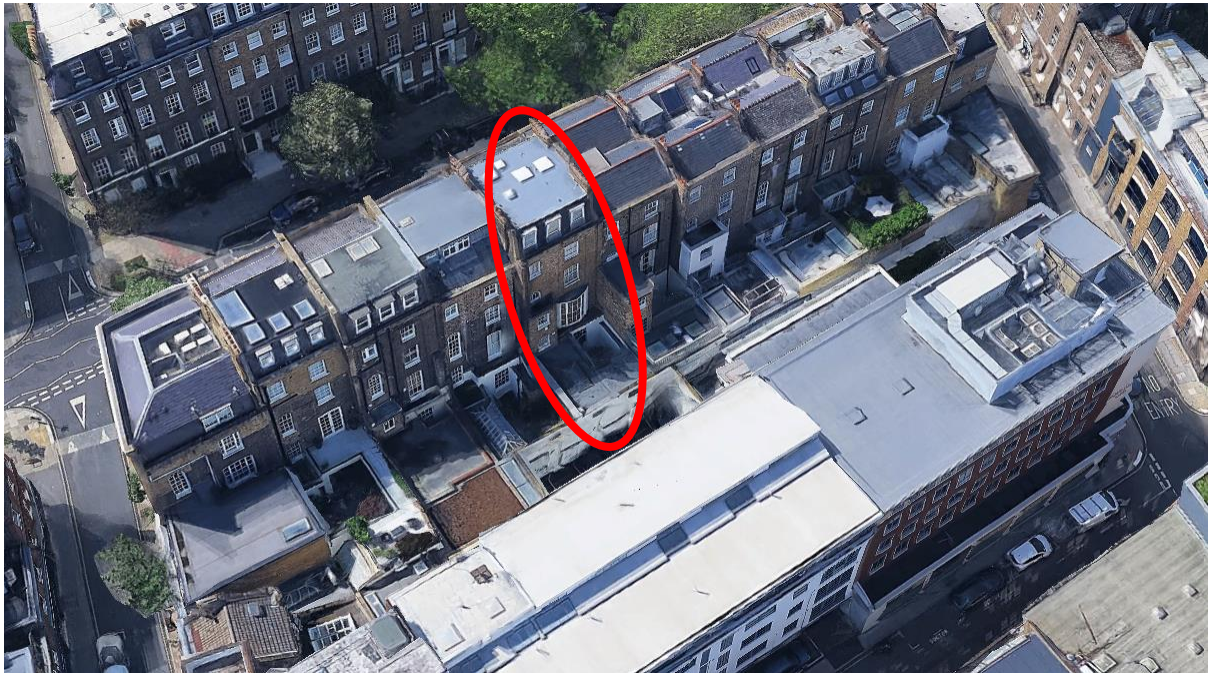
Fig 1. Aerial view of 14 John Street (roof circled in red).