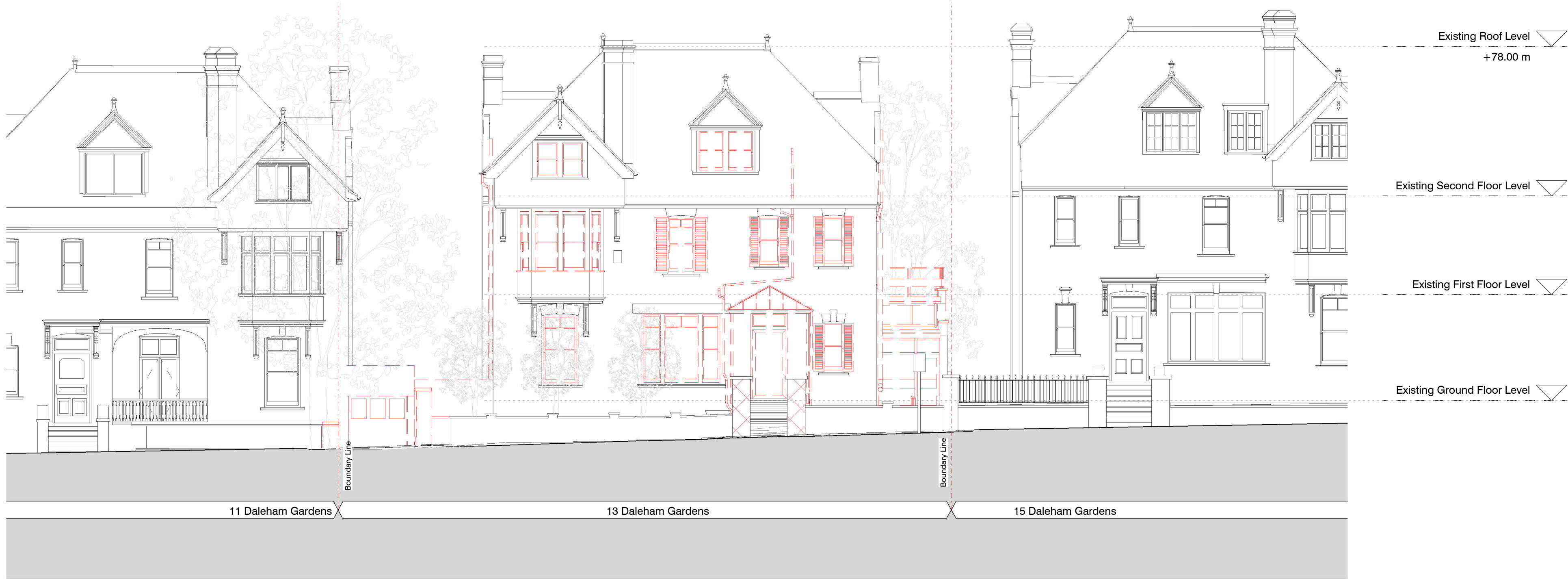
1 Demolition East Elevation (Street) P_2100 1 : 100