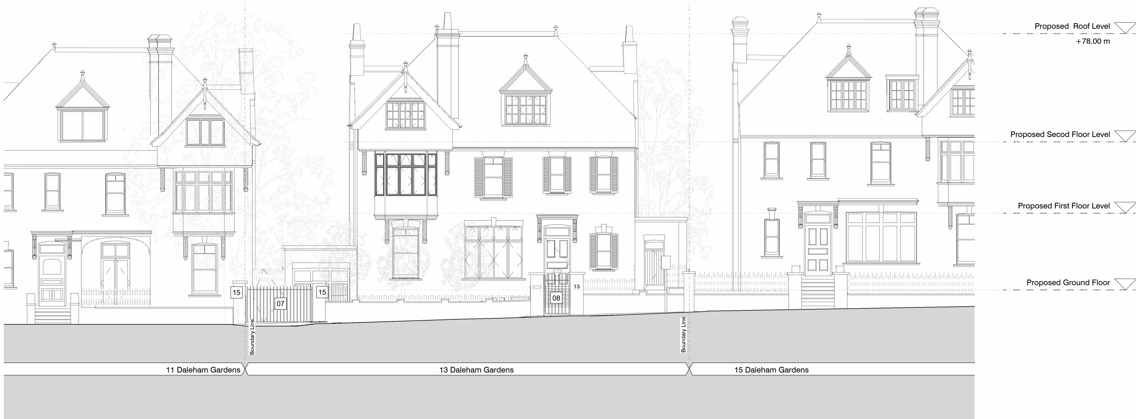
2 Proposed East Elevation (Street) P_2100 1 : 100