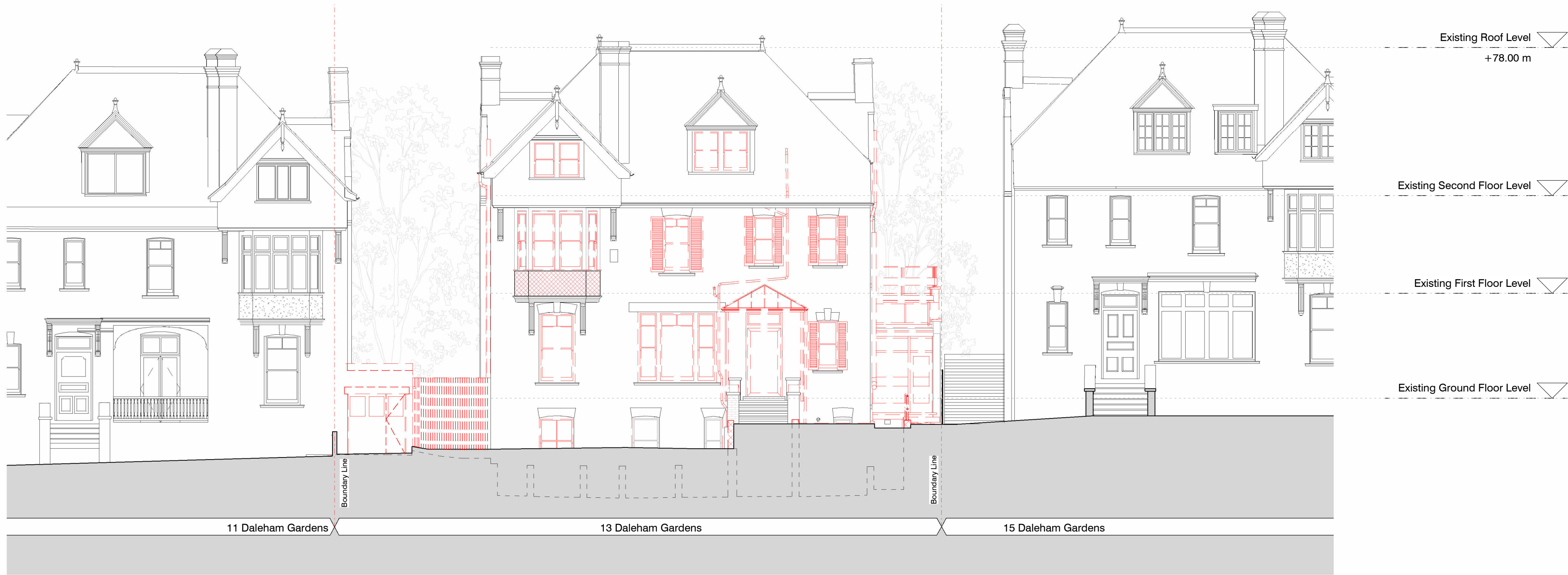
1 Demolition Front Elevation P_2101 1 : 100