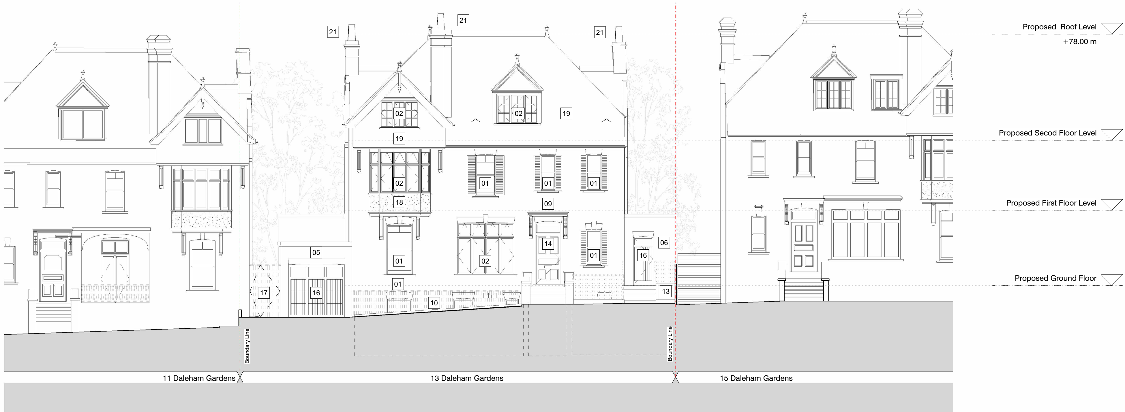
2 Proposed Front Elevation P_2101 1 : 100