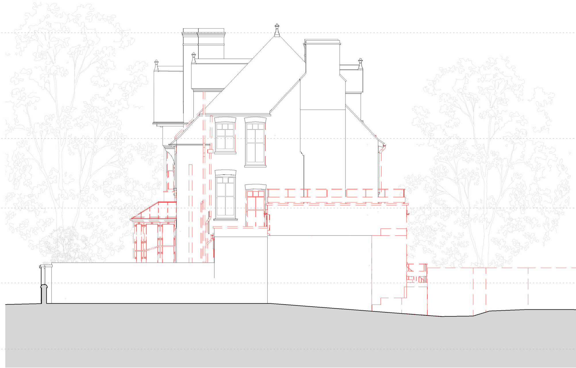
3 Demolition North Elevation (Side) P_2103 1 : 100