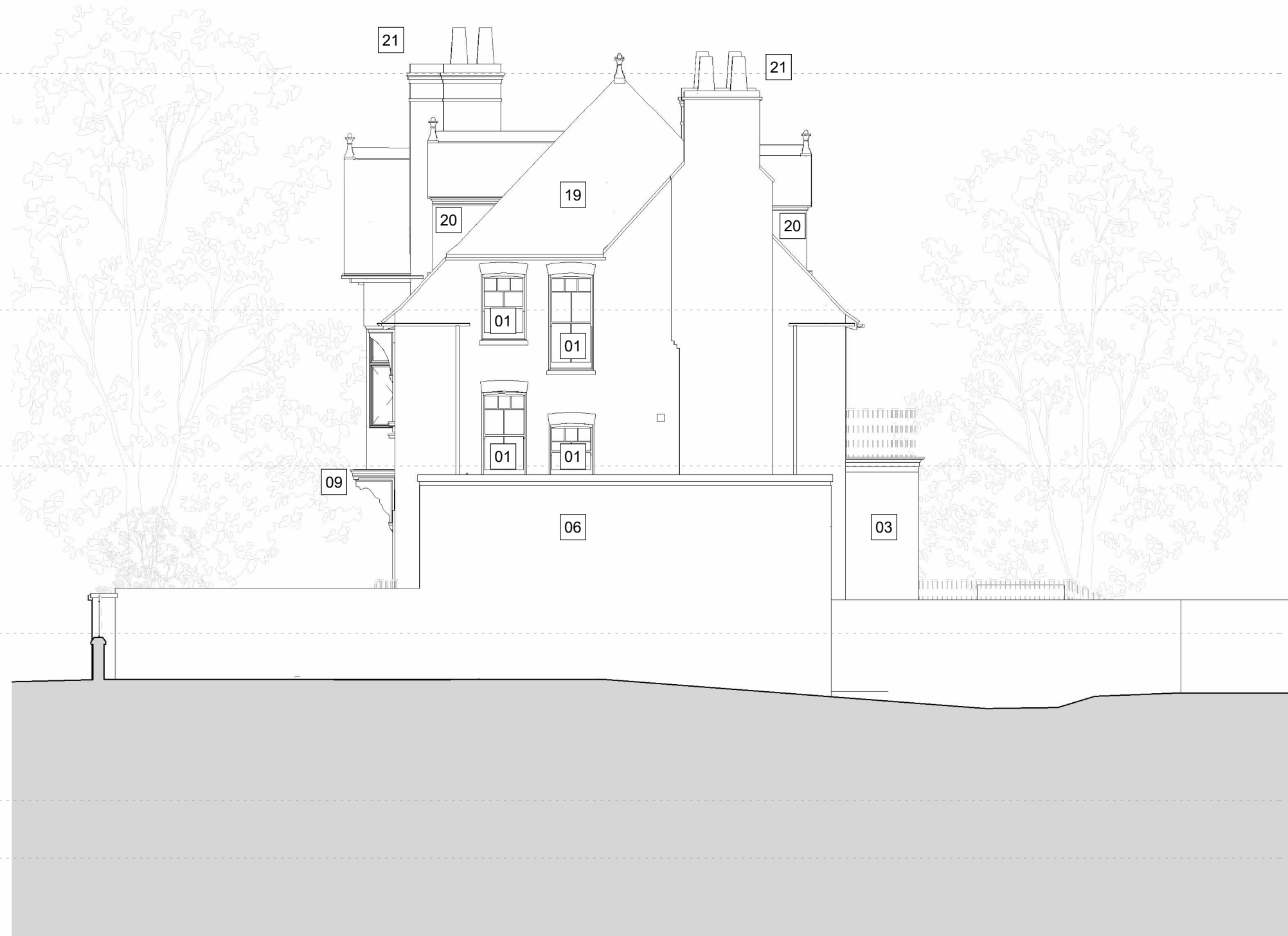
4 Proposed North Elevation (Side) P_2103 1 : 100