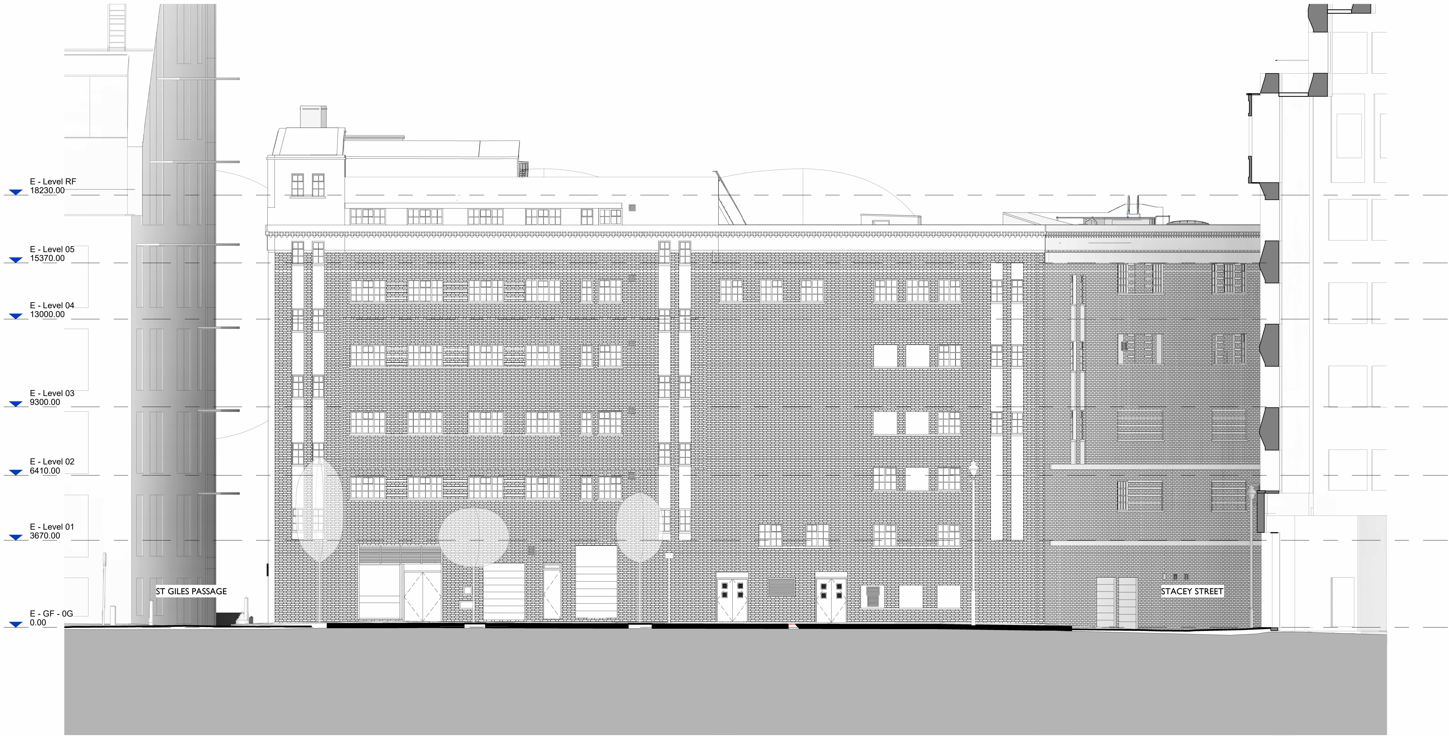
02-3003 - Northwest Elevation 1 : 100