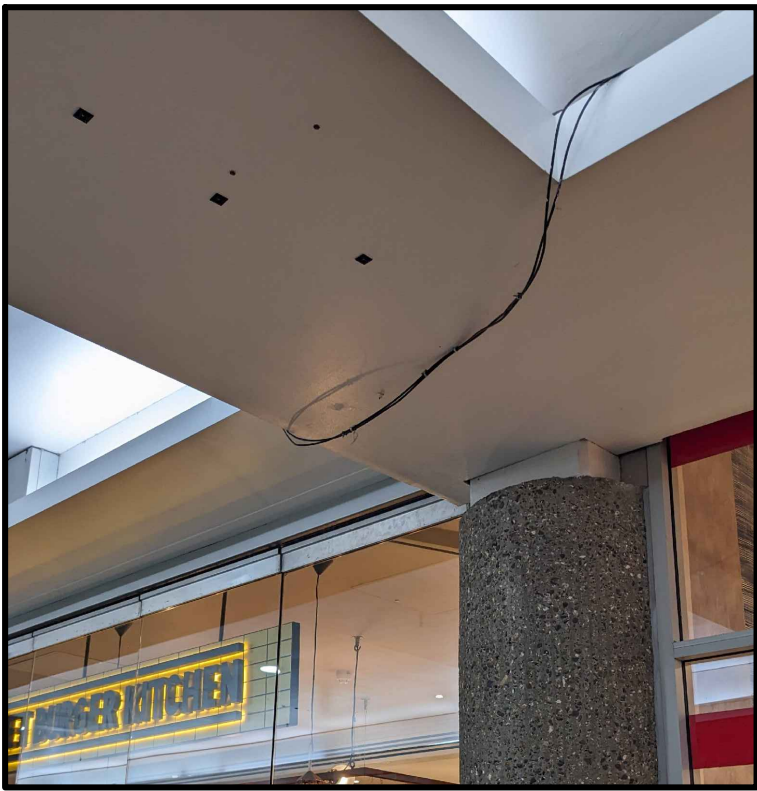
Photograph of beam and change in ceiling height