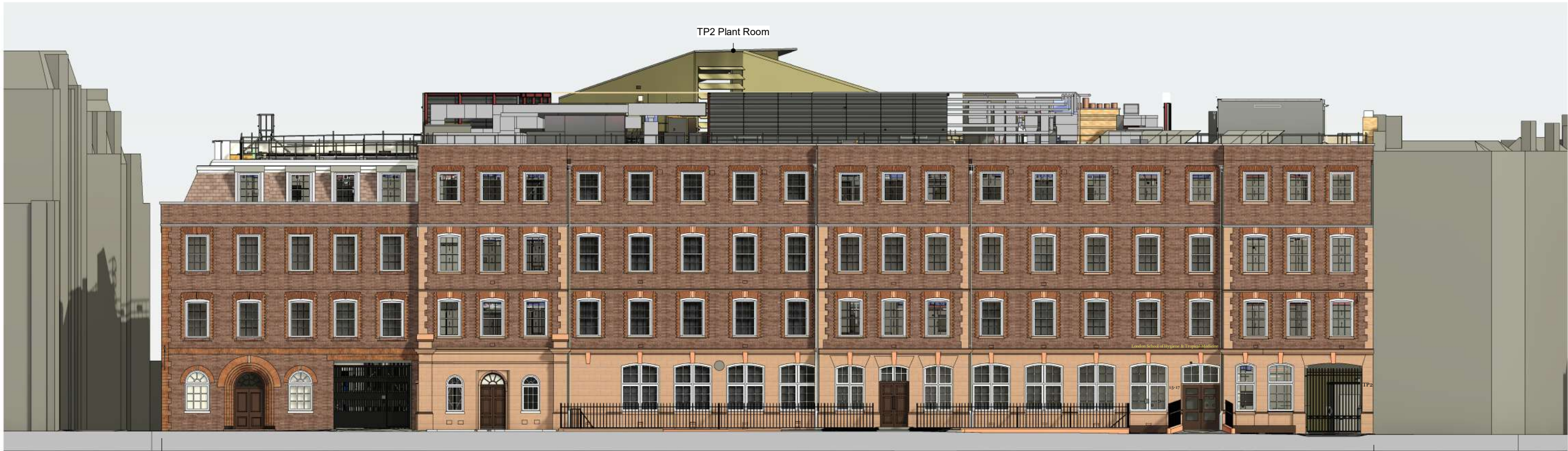
LSHTM TP1 Tavistock 15-17 Proposed South Elevation

NOTES 1. Filename: TP1 - RSS - 00 - ZZ - M3 - A - Tavistock Place 2. Do not scale from this drawing in either paper or digital form. This drawing is not to be scaled. Use figured dimensions only. Detailed site survey to be carried out to establish tolerances. Figured dimensions are in mm. All dimensions shall be verified on site before proceeding with the work. The architect shall be notified of any discrepancies. 3. This drawing has been produced for sole use on this project and is not intended for use by any other person or for any other purpose. ©CopyrightRSS(U.K.) 4. All printed copied should be made at 100% of the original page size. Use scale bars, where included, to check that the drawing has been printed to the intended scale as identified in the drawing title block. 5. This drawing is not intended for construction unless specifically described as such.