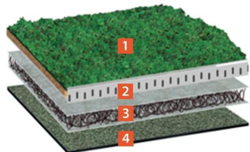
Extensive lightweight sedum system