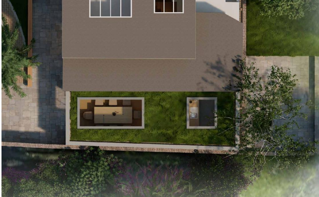
Proposed roof plan showing sedum roof

Prior to commencement of development, full details in respect of the living roof in the area indicated on the approved roof plan shall be submitted to and approved by the local planning authority. The details shall include i. a detailed scheme of maintenance ii. sections at a scale of 1:20 with manufacturers details demonstrating the construction and materials used iii. full details of planting species and density