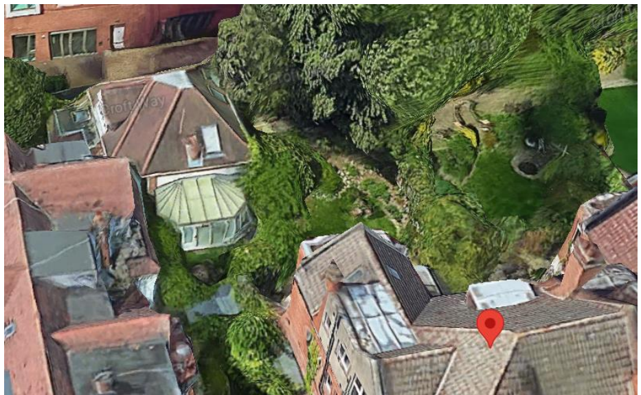
Image 2: Aerial image showing the location of the objector in relation to the application site.