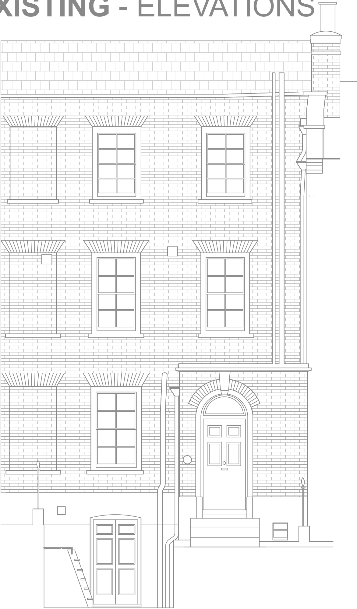
1 Existing Front Elevation 200 Scale 1:50@A3