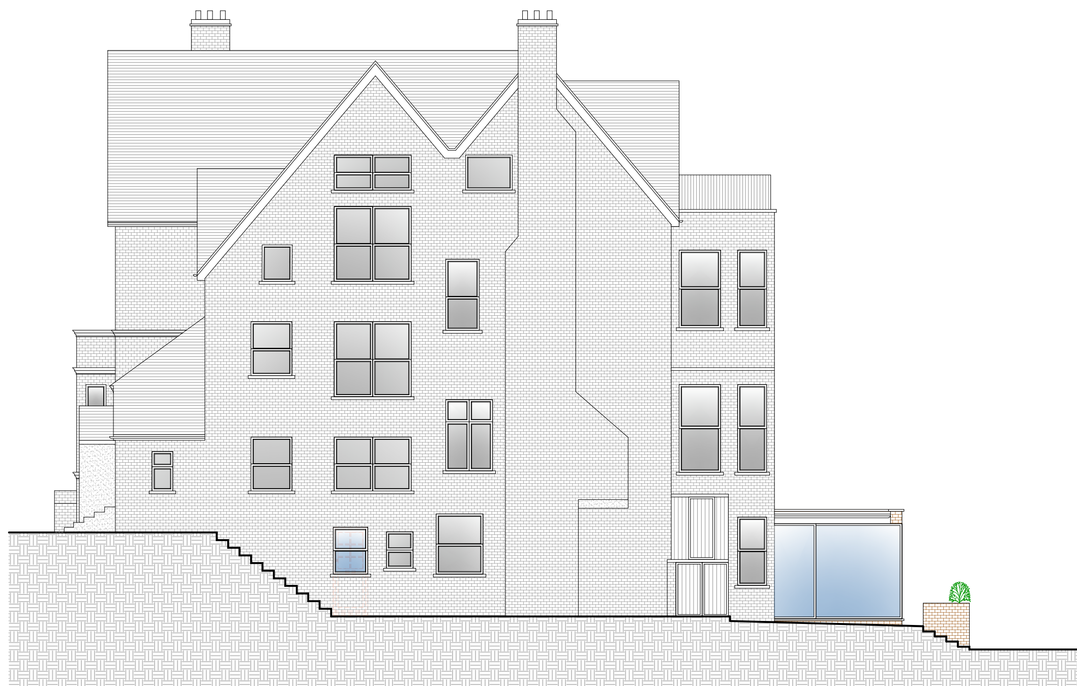
6 Proposed Side Elevation