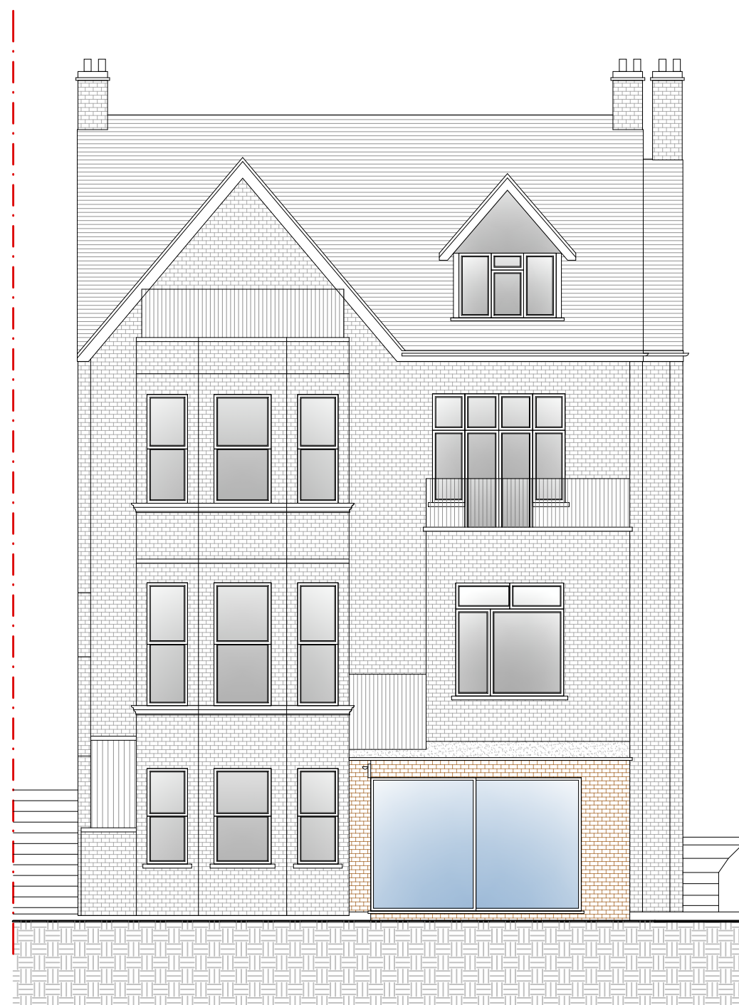
4 Proposed Rear Elevation