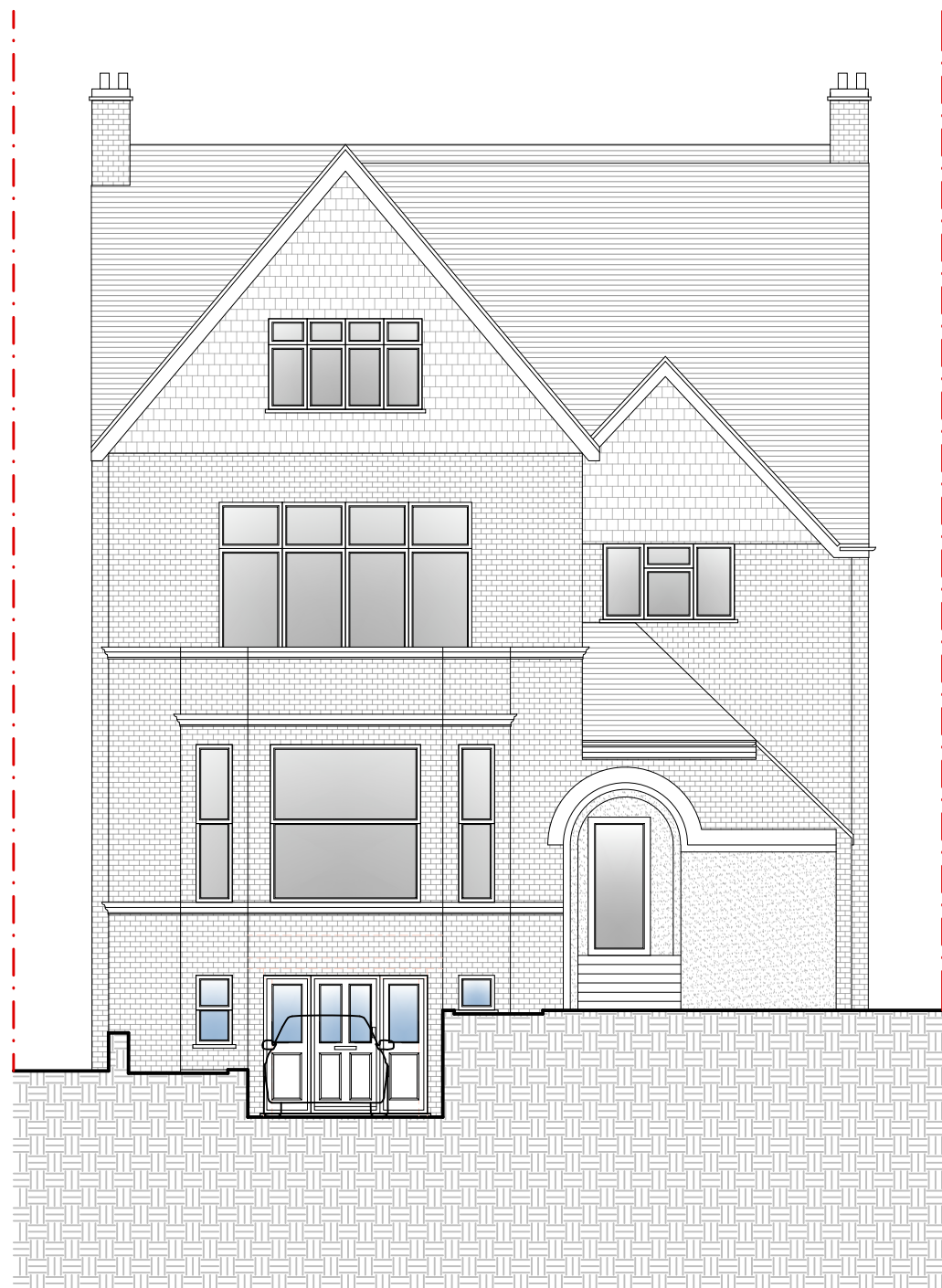
3 Proposed Front Elevation