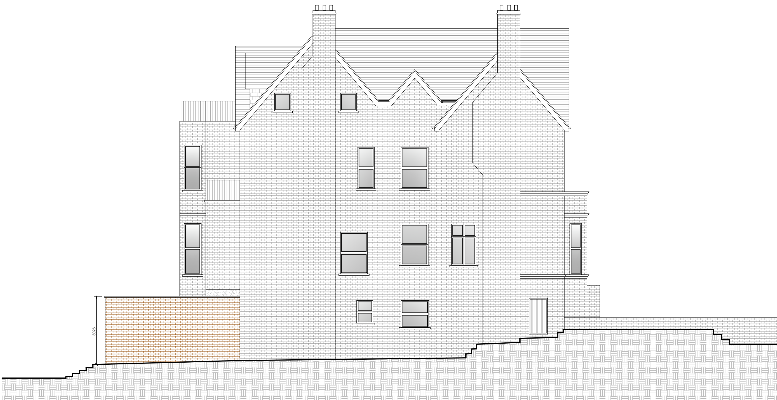
5 Proposed Side Elevation