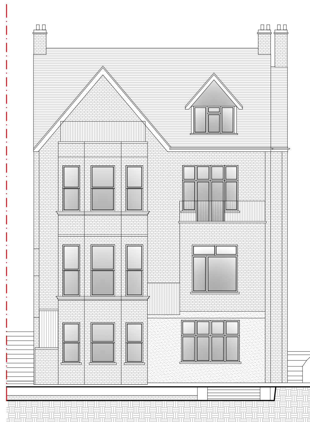
④ Existing Rear Elevation