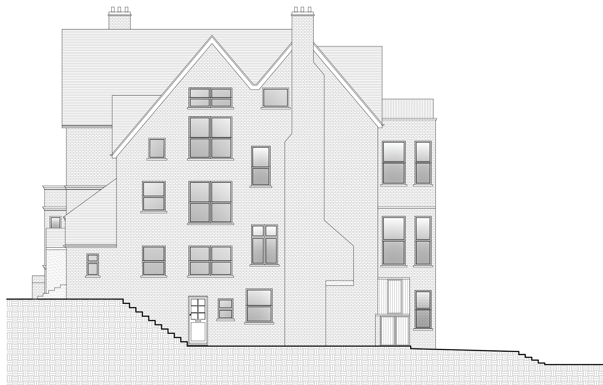
⑥ Existing Side Elevation