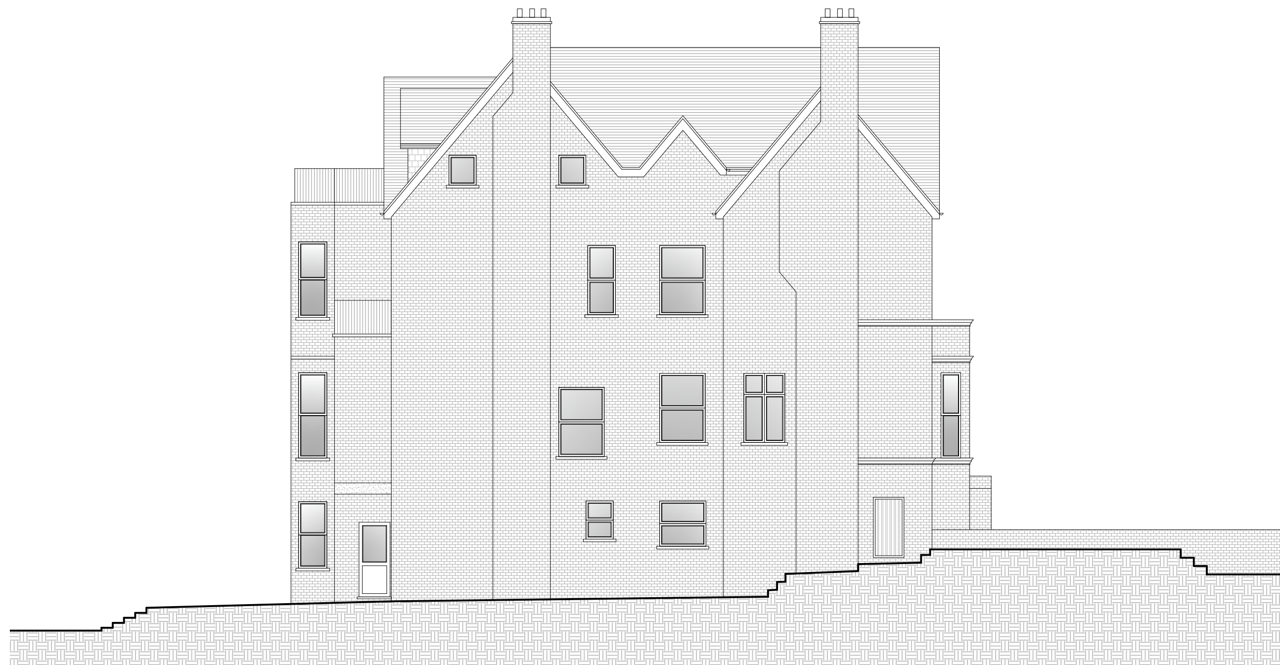
⑤ Existing Side Elevation