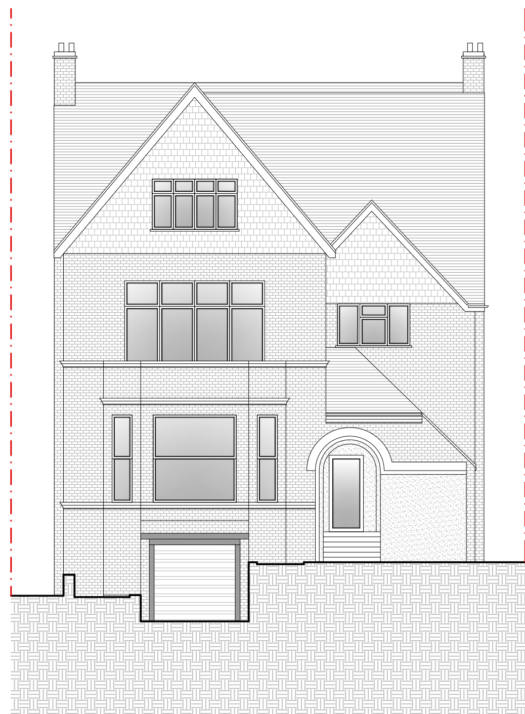
③ Existing Front Elevation