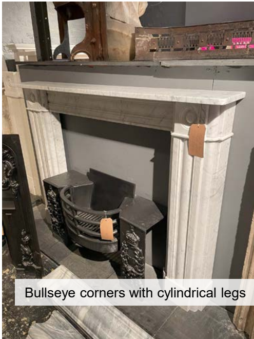
Bullseye corners with cylindrical legs