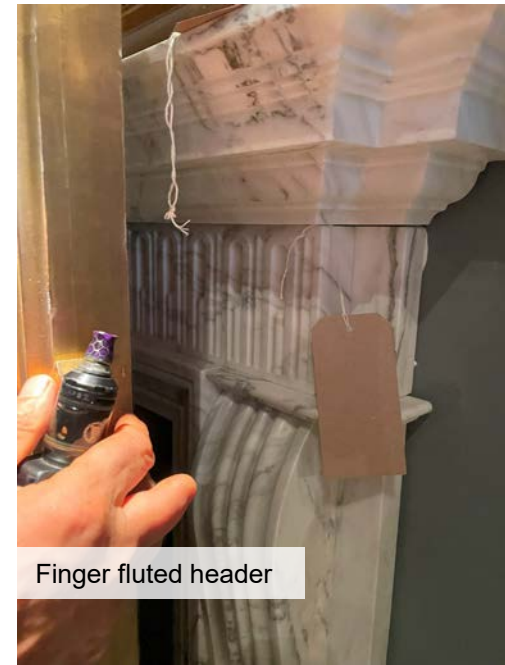
Finger fluted header