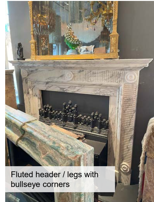
Fluted header / legs with bullseye corners