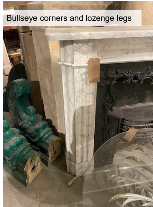
Bullseye corners and lozenge legs