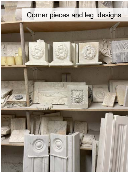
Corner pieces and leg designs