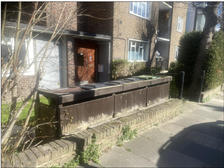
EXISTING FRONT GARDEN WALL Scale 1:50@A3