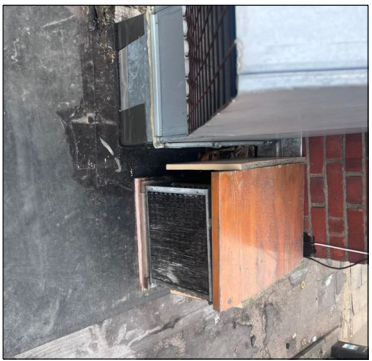
unit with temporary cover