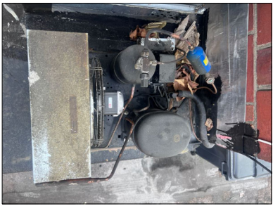
unit without cover - please refer to tech sheet for details inc Db levels