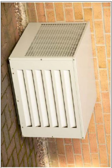
new proposed cover - please refer to tech spec for details