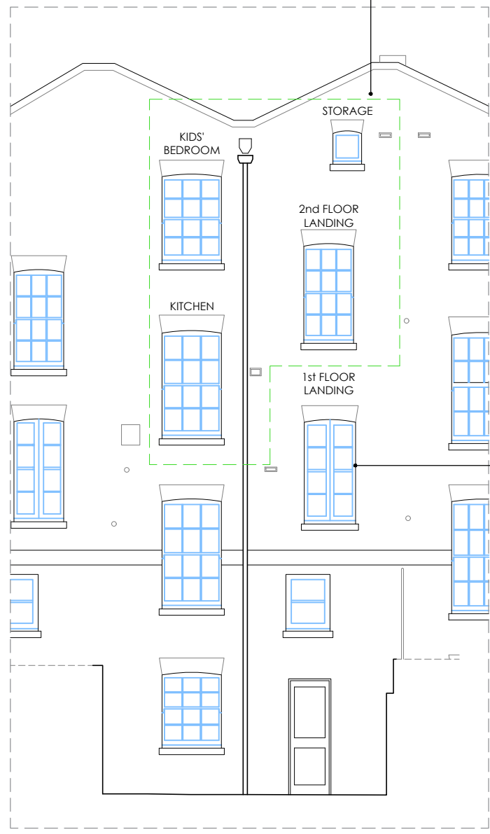
802 Rear Elevation 1:100