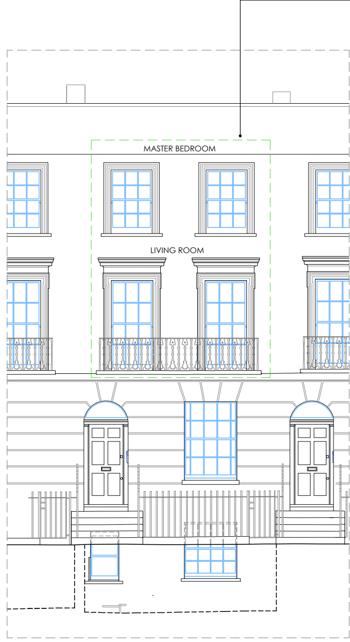
802 Front Elevation 1:100