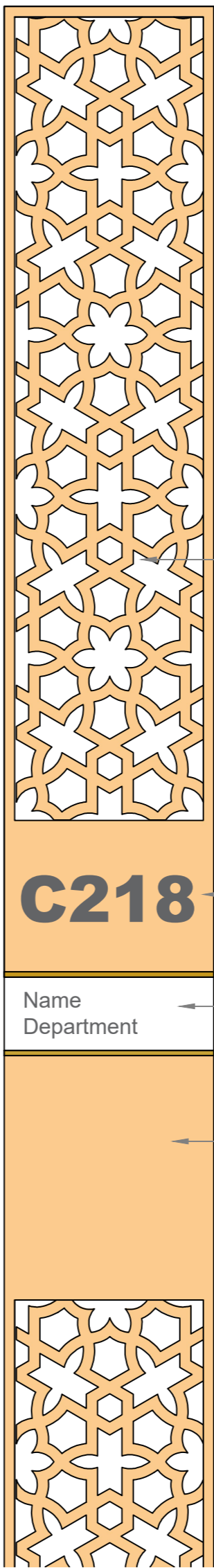
DETAILED ELEVATION SCALE - 1:5 @ A2