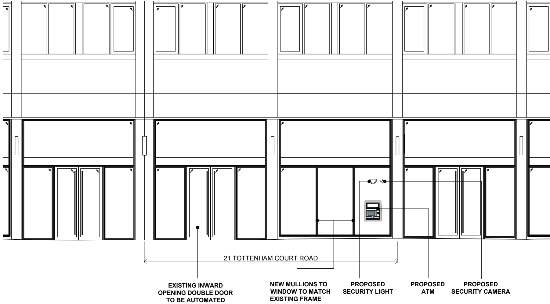
02 PROPOSED NORTH EAST ELEVATION 1:100@A3

DO NOT SCALE FROM THIS DRAWING - STATED DIMENSIONS REFER. CONTRACTORS SHALL BE RESPONSIBLE FOR THE CHECKING OF ALL STATED DIMENSIONS, WITH ANY ANOMALIES BEING IDENTIFIED TO THE ORIGINATOR PRIOR TO ANY CONSTRUCTION OR FABRICATION WORKS COMMENCING.