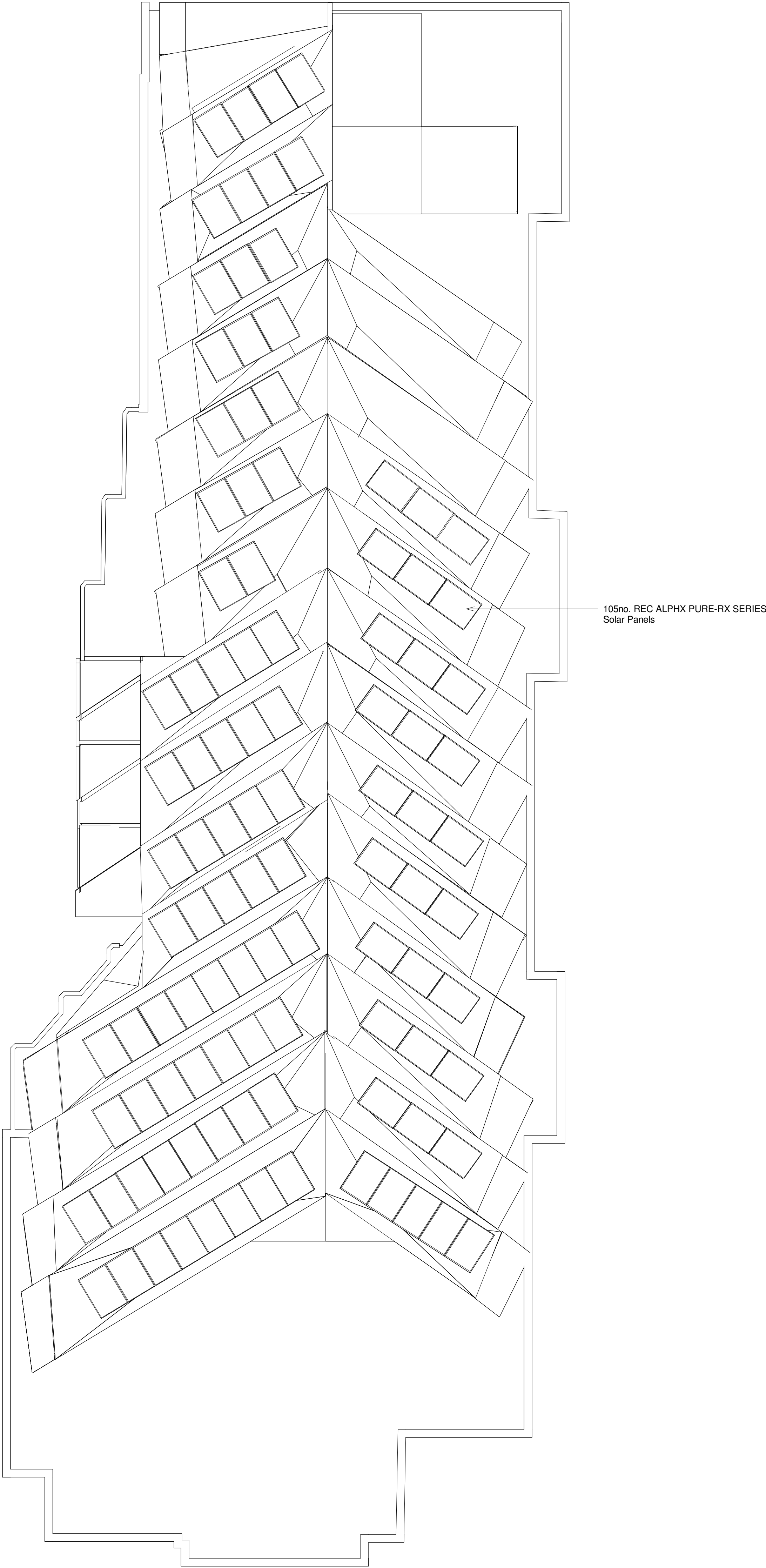
1 Proposed Roof Plan 1 : 100