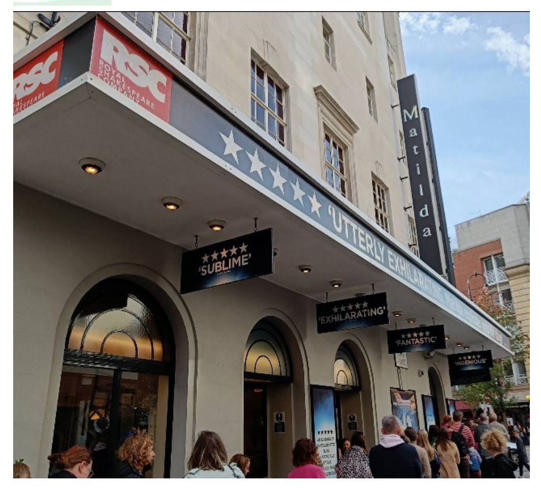
Existing photograph shows the external street level double sided projecting hanging sign under the canopy on Earlham Street.