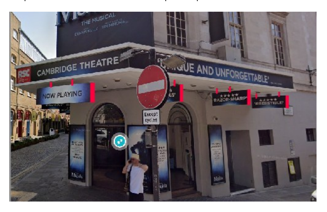
Proposed visualisation shows the external street level double sided projecting hanging signs under the canopy on Mercer Street.