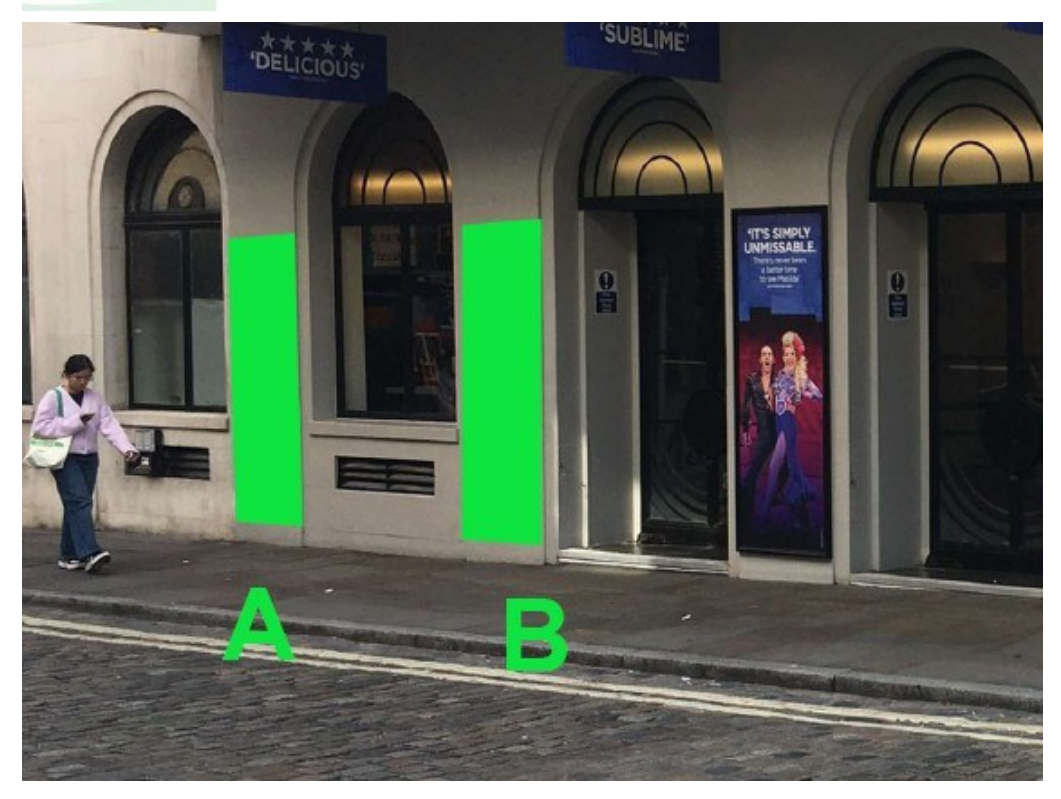
Proposed visualisation shows 2no. poster positions to Earlham Street.