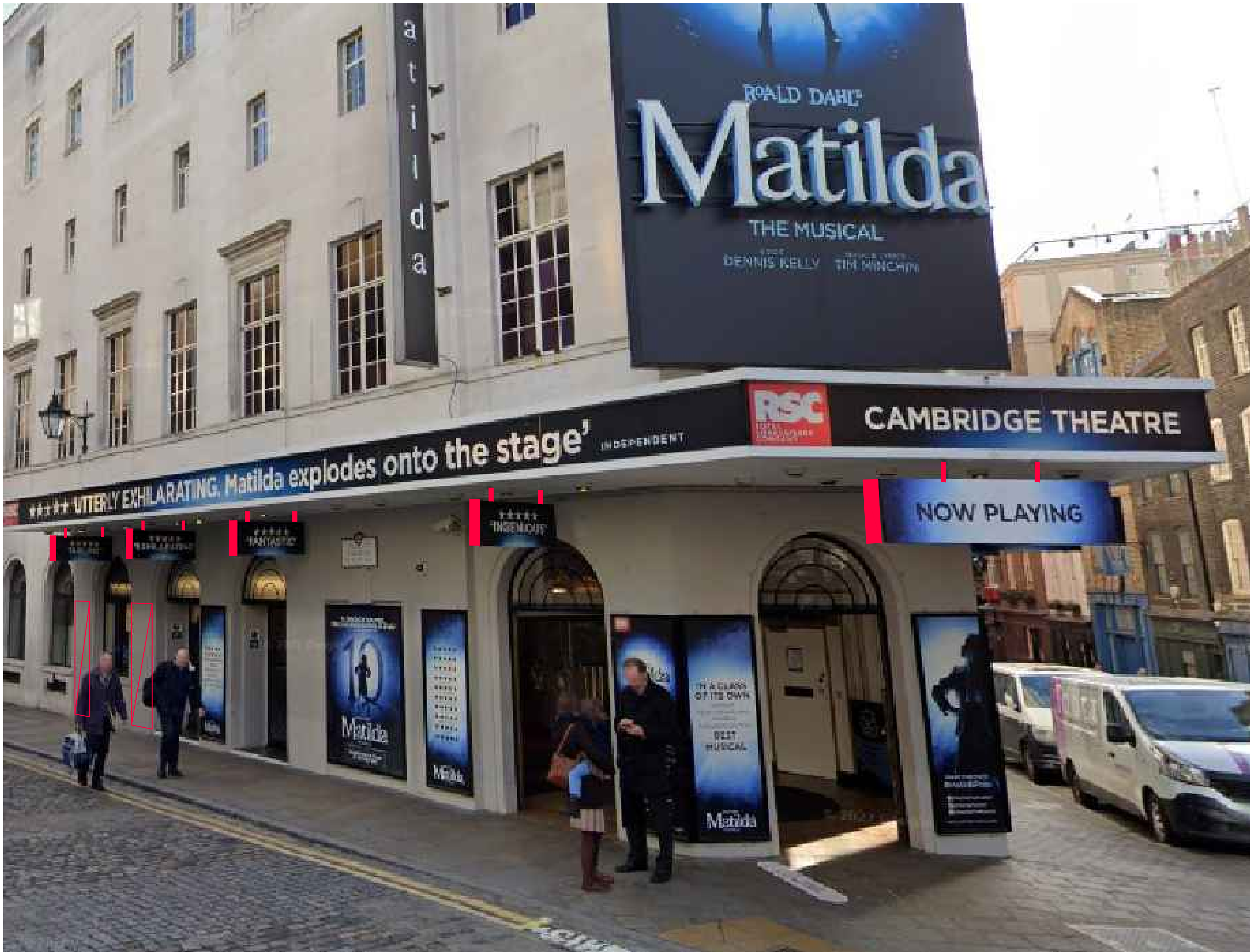
PROPOSED EARLAM STREET AND FRONT ELEVATIONS (NTS)