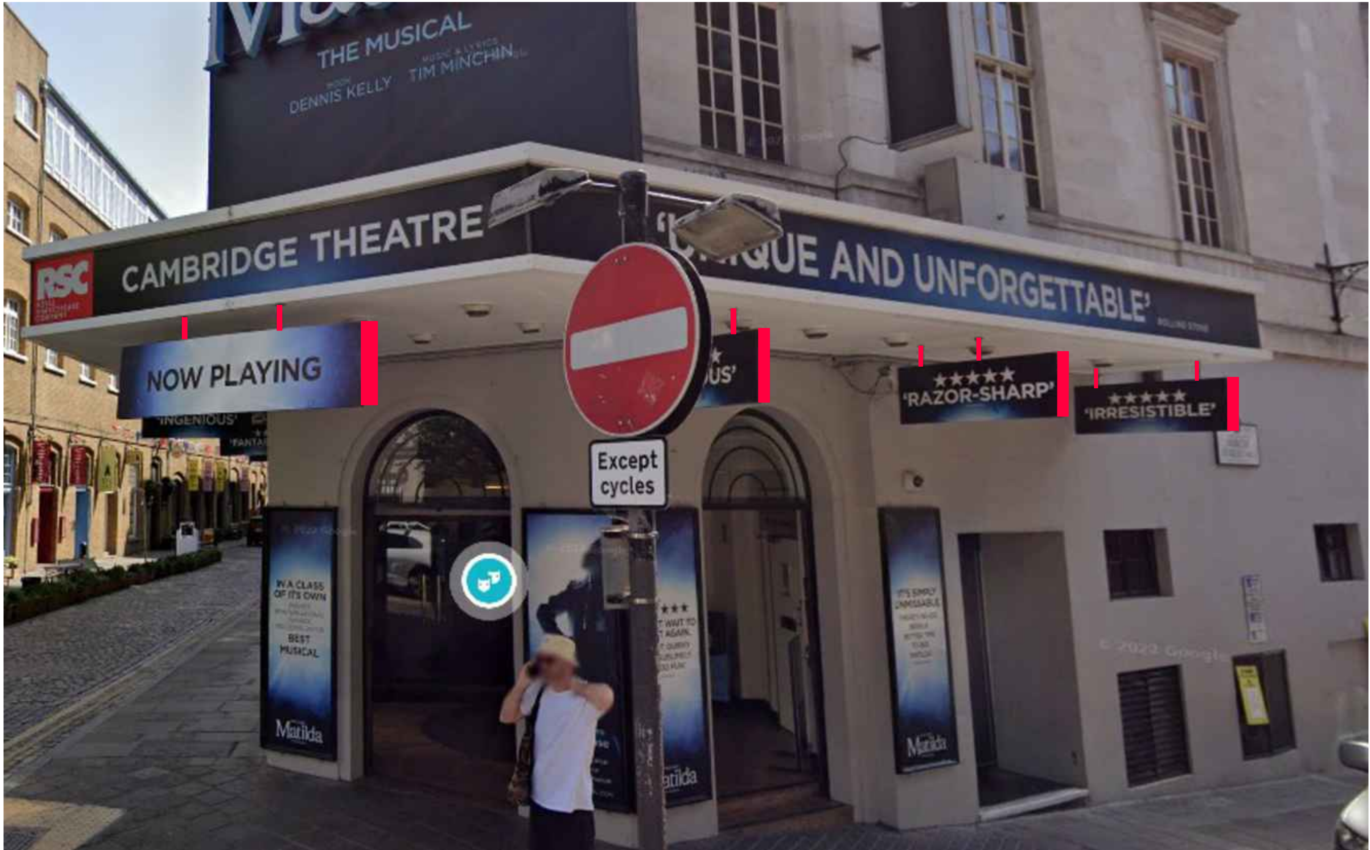
PROPOSED MERCER STREET AND FRONT ELEVATIONS (NTS)