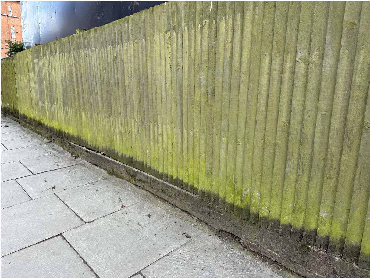
Rotten gravel board and lower part of the fence, indicating evidence of rising damp