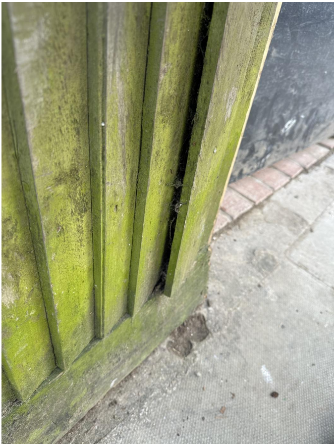
Loose feather edge boards