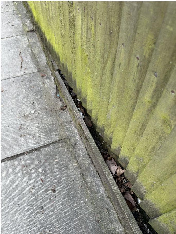
Fence is not aligned with the gravel board