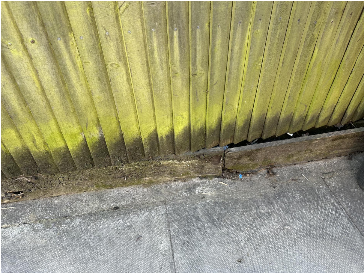
Rotten gravel board and lower part of the fence, indicating evidence of rising damp