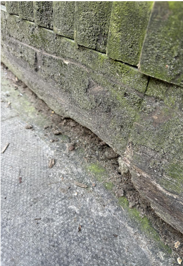
Rotten gravel board