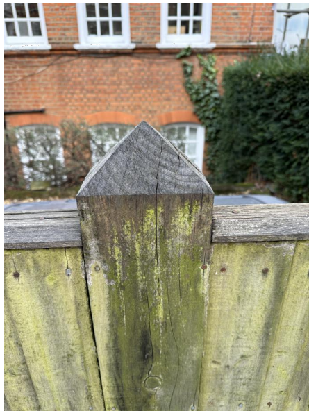
Timber post - 7 Wedderburn Road