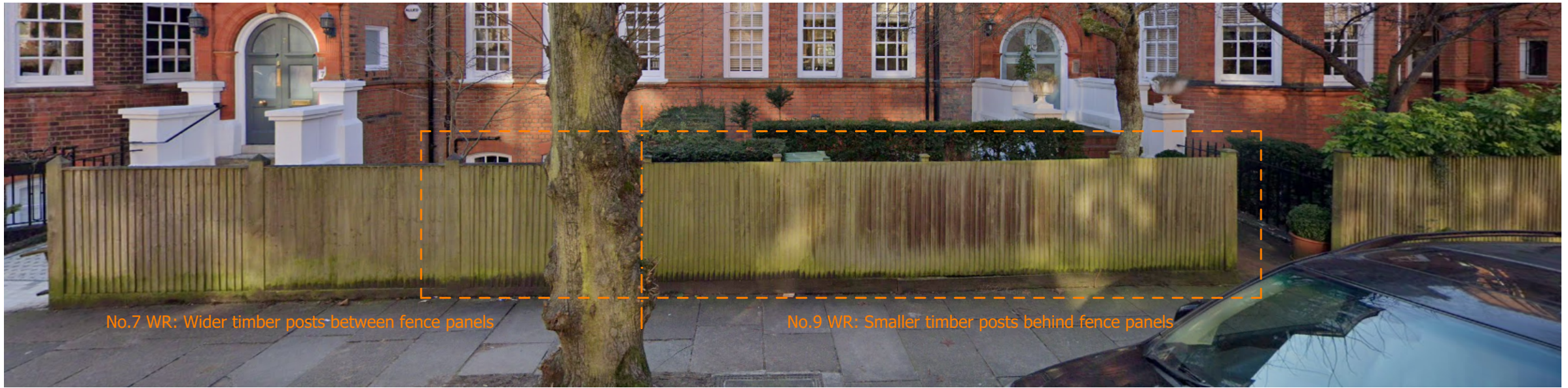
7 Wedderburn Road