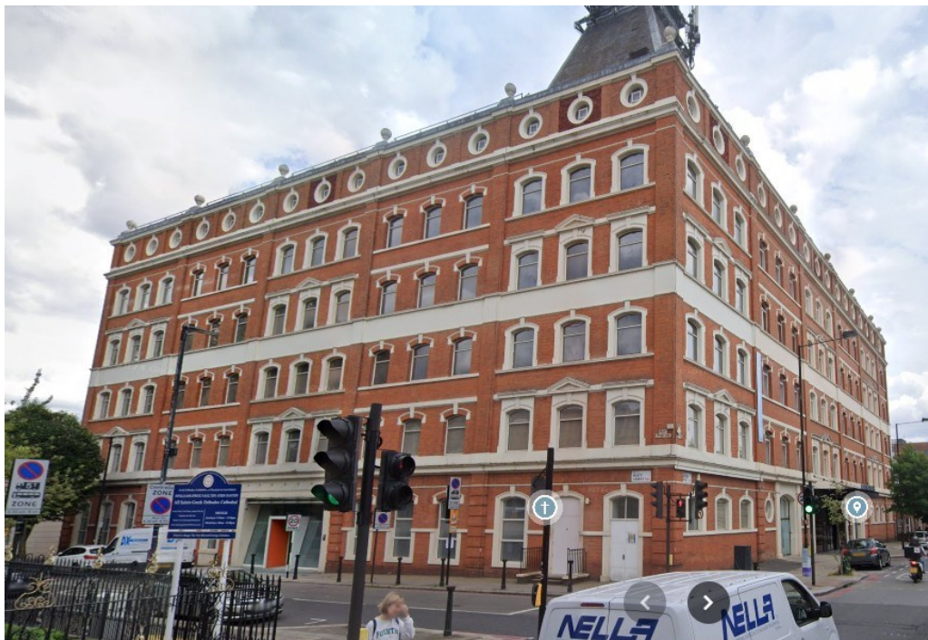
Existing google view showing corner elevations of Pratt and Camden Streets.