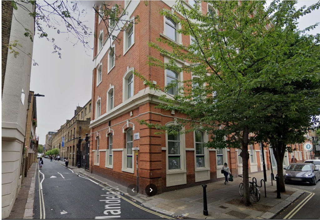
Existing google view showing corner elevations of Pratt and Mandela Streets.