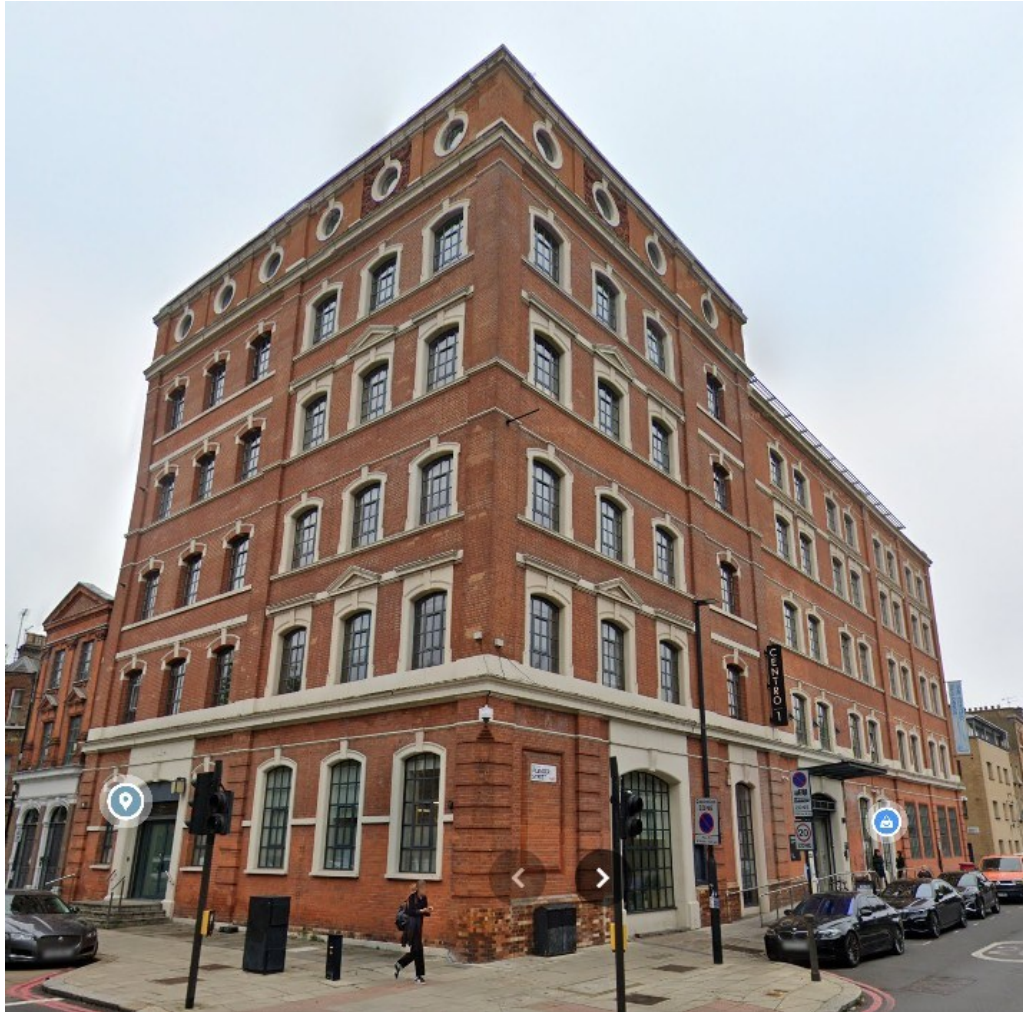
Existing google view showing the corner elevations on Plender and Camden Streets.