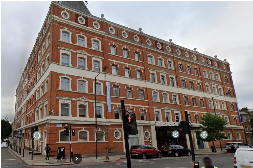
Existing google view showing the corner elevations to Camden and Pratt Streets.