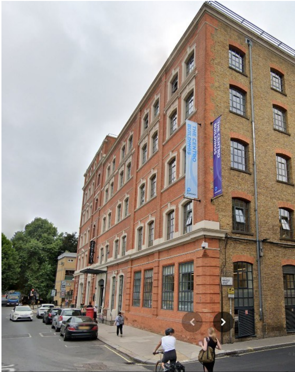
Existing google view showing the corner elevations of Mandela Street and Plender Street where the existing banners are located.