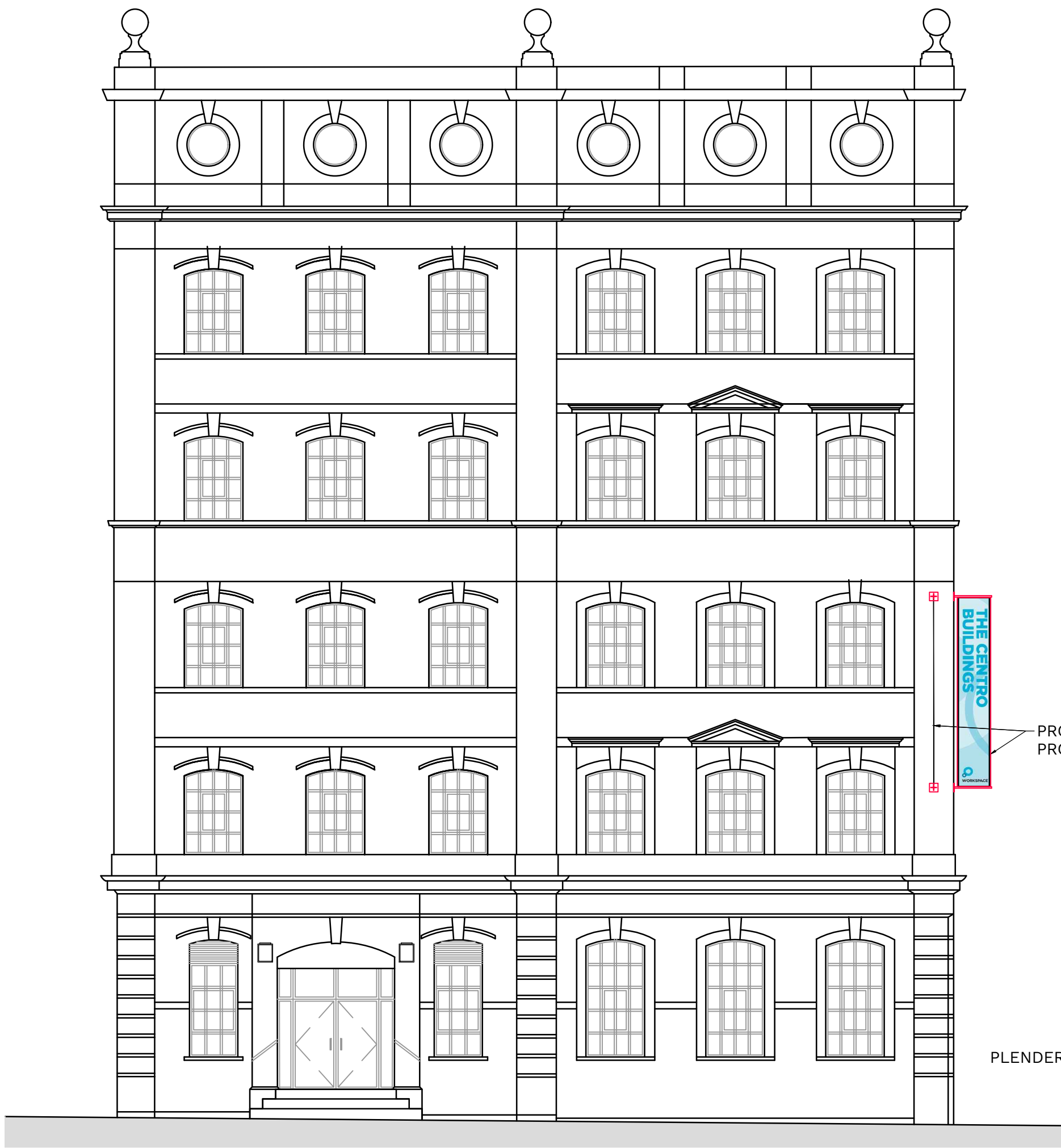
PROPOSED CAMDEN STREET ELEVATION (SCALE 1:100 AT A1)