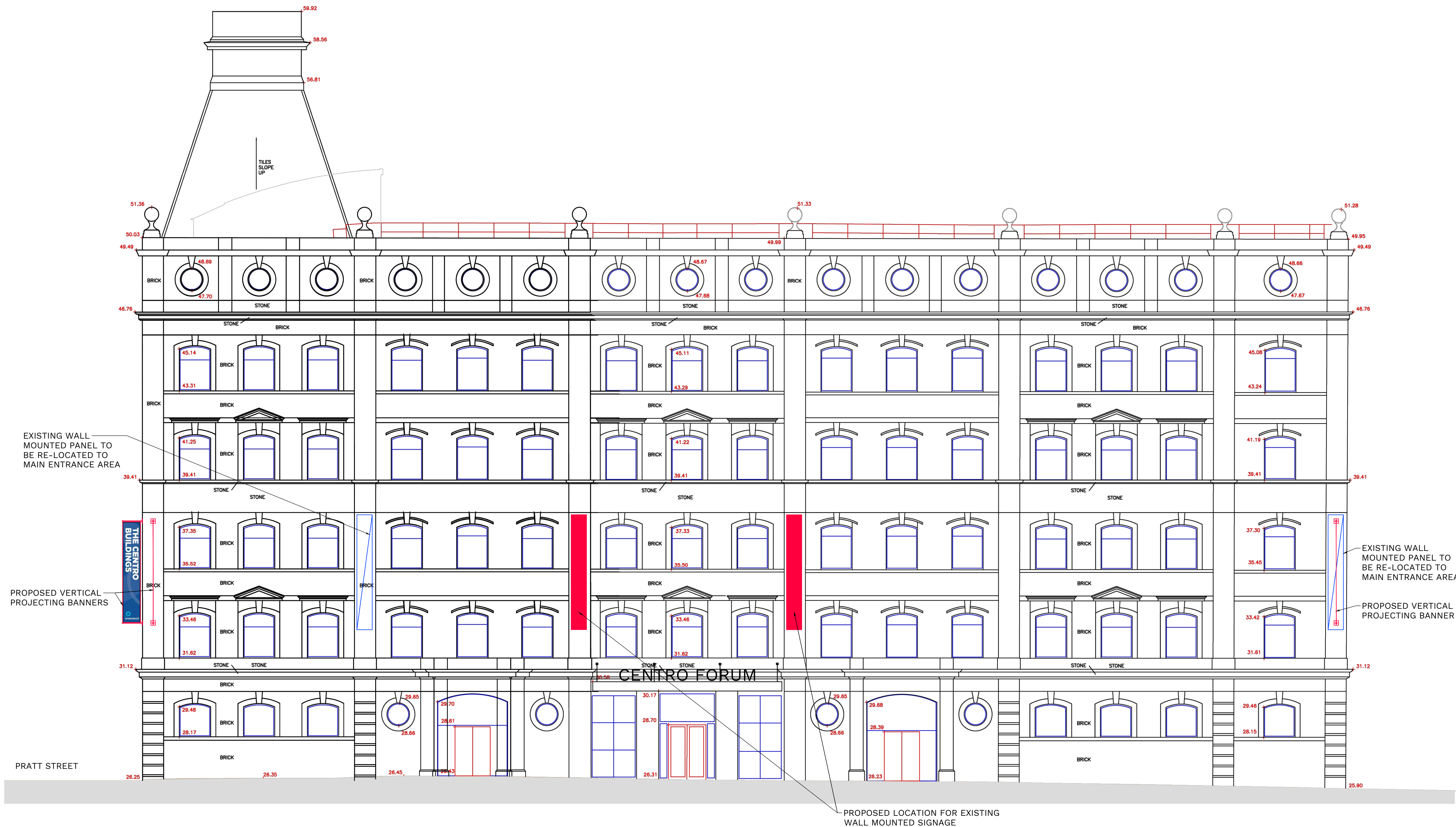
PROPOSED CAMDEN STREET ELEVATION (SCALE 1:100 AT A1)