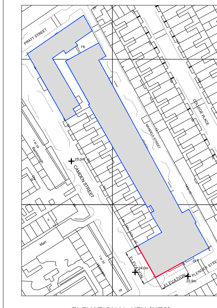
ELEVATIONAL KEY (NTS)