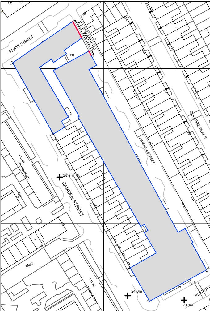
ELEVATIONAL KEY (NTS)