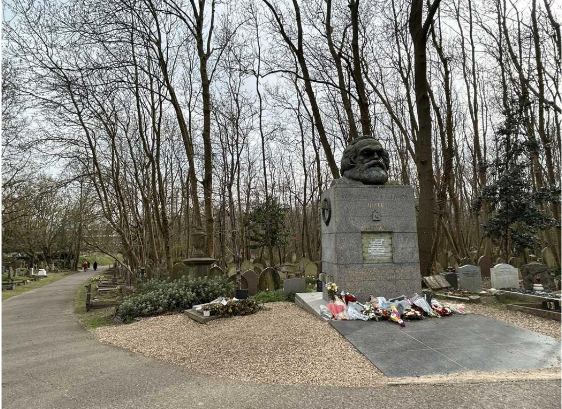
Image 2 - View from just past the Marx's Tomb