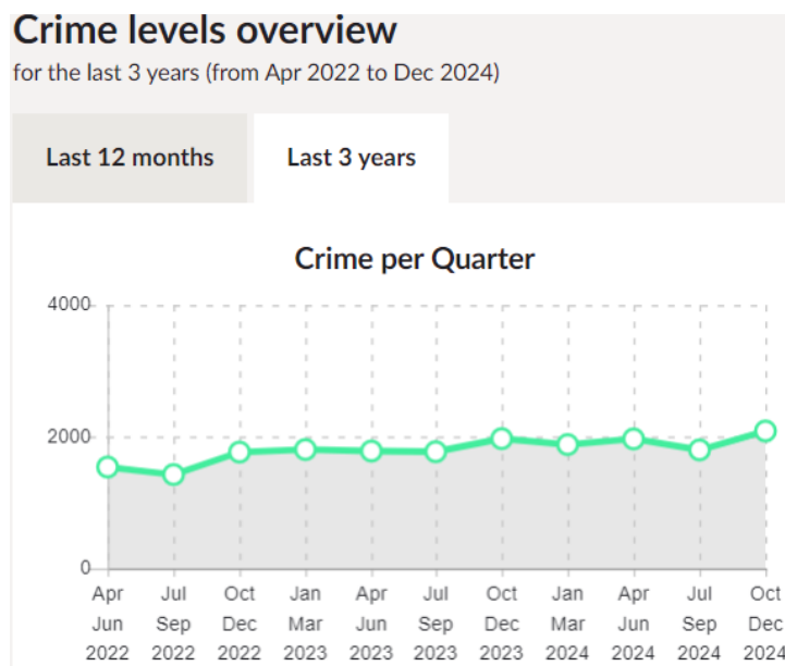
Line graph showing the number of crimes over the last three (3) years for Holborn and Covent Garden ward.

London. Camden’s Statement of Licensing Policy sets out the Council’s approach to licensing and special licensing policies apply to these areas.”