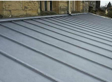
LEAD SHEET FINISH EXAMPLE