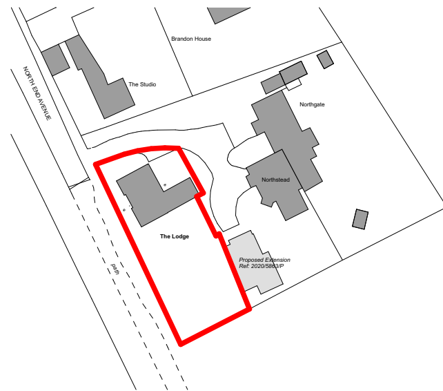
Brandon House The Studio Northgate Northstead The Lodge Proposed Extension Ref: 2020/5863/P NORTH END AVENUE path