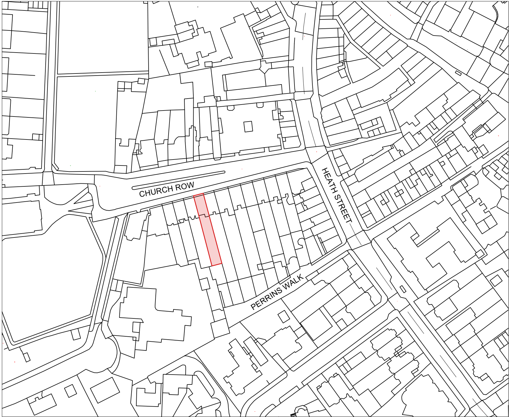
1 Site Plan Scale: 1:1250