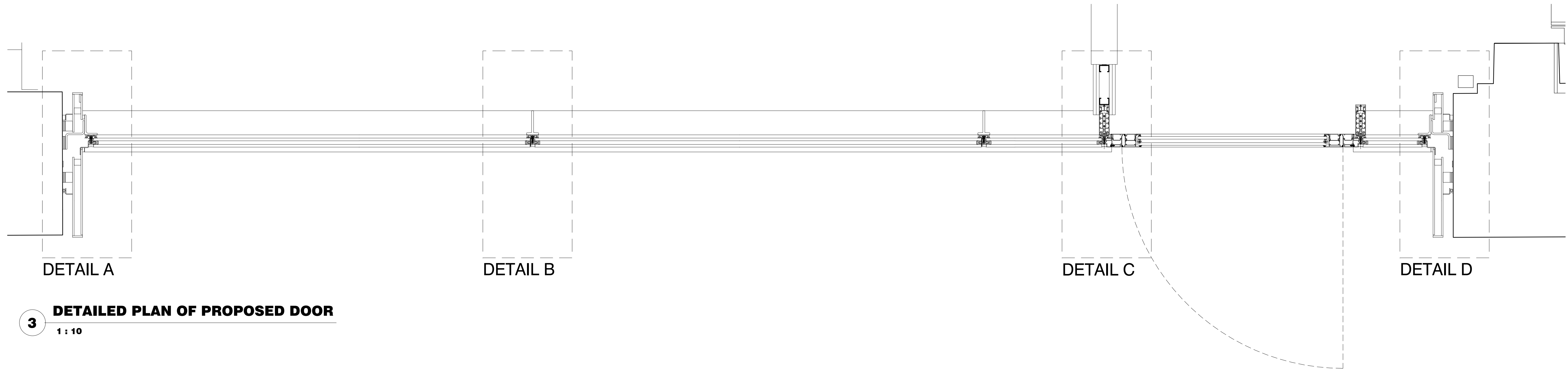
3 DETAILED PLAN OF PROPOSED DOOR 1 : 10