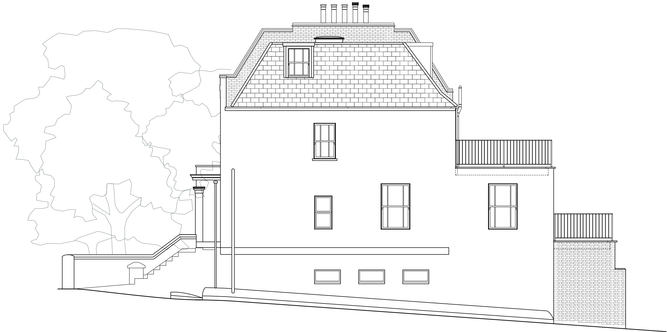
Existing North Elevation