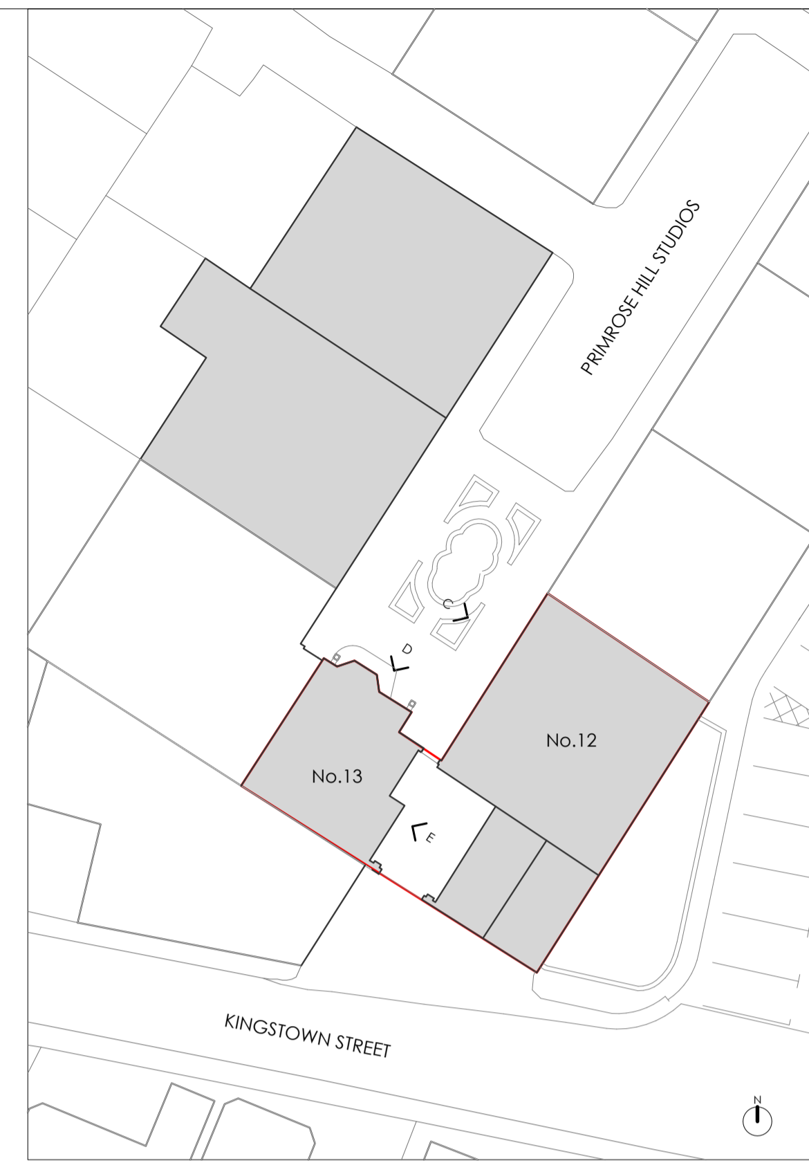
Site Plan 1:250