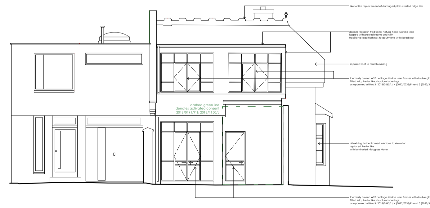
3 Proposed Elevation E 301 1:100 @ A1