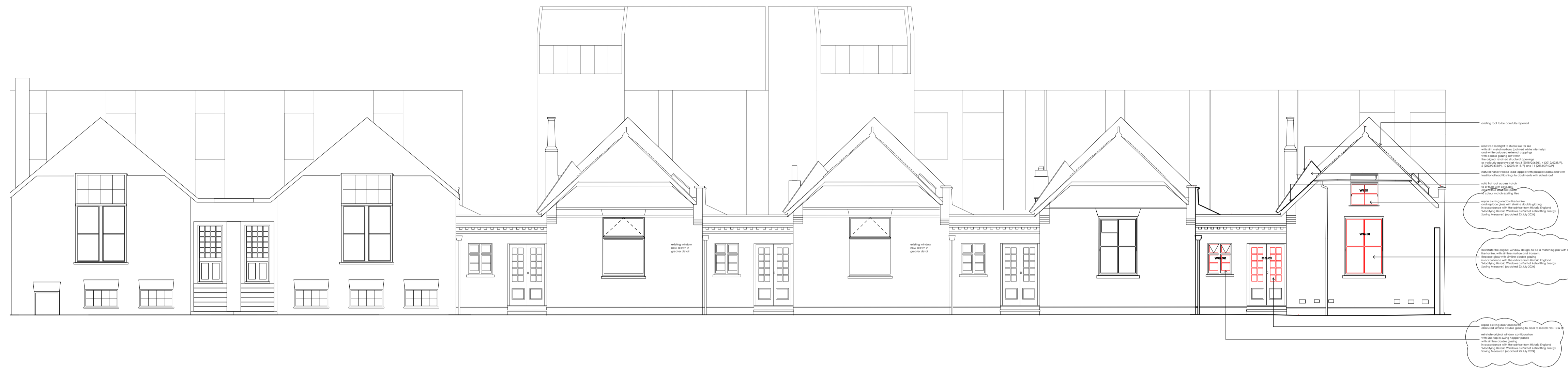
1 Proposed Elevation C 301 1:100 @ A1