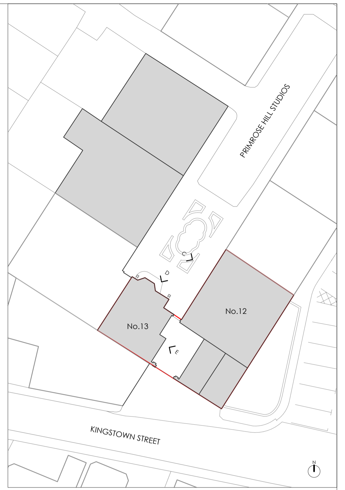
Site Plan 1:250