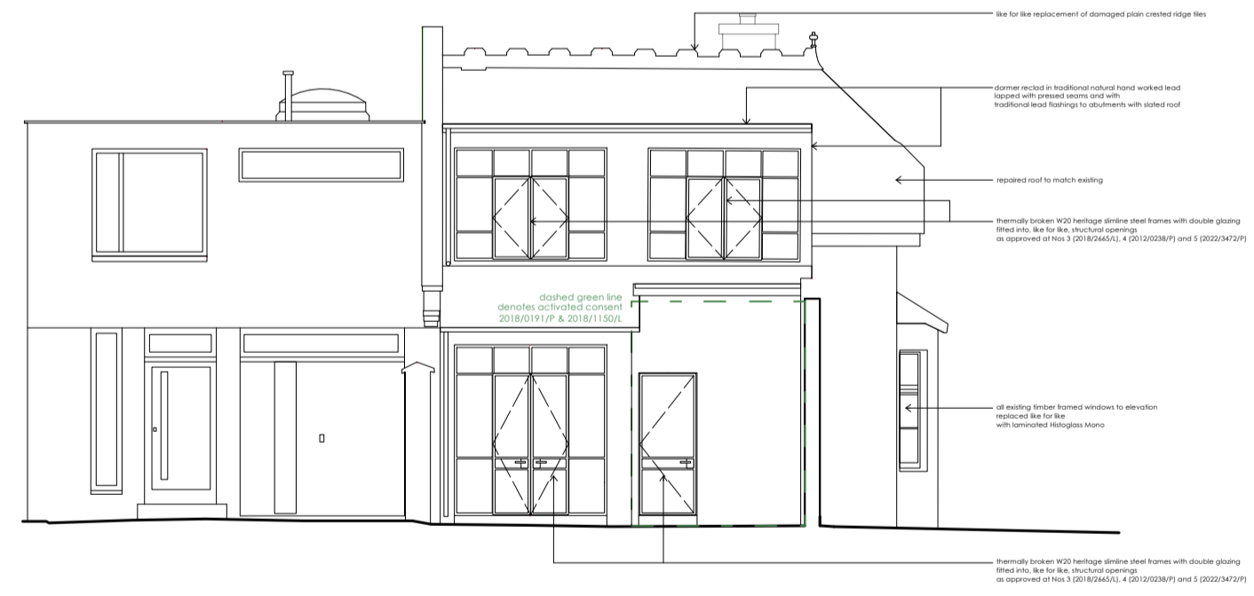
3 Proposed Elevation E 301 1:100 @ A1