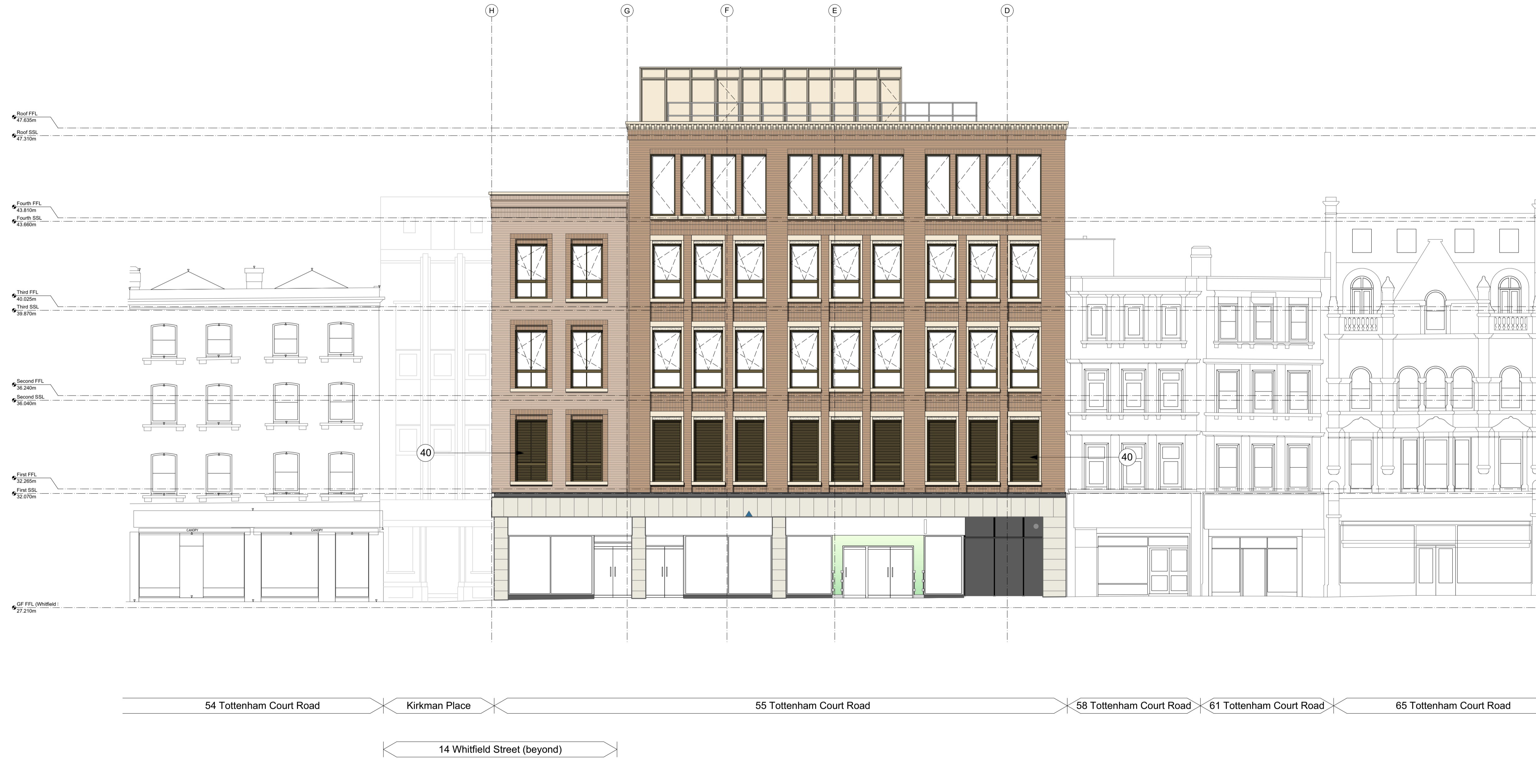
1 Proposed East (Tottenham Court Road) elevation Scale: 1:100